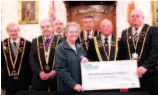
Sir Knight from the City of Belfast Grand Black Chapter present £7,000 to a representative from Macmillan Cancer Support.

Members of the Institution have a distinguished record for charitable outreach, raising nearly £700,000 for various good causes on a biennial basis since 2002.