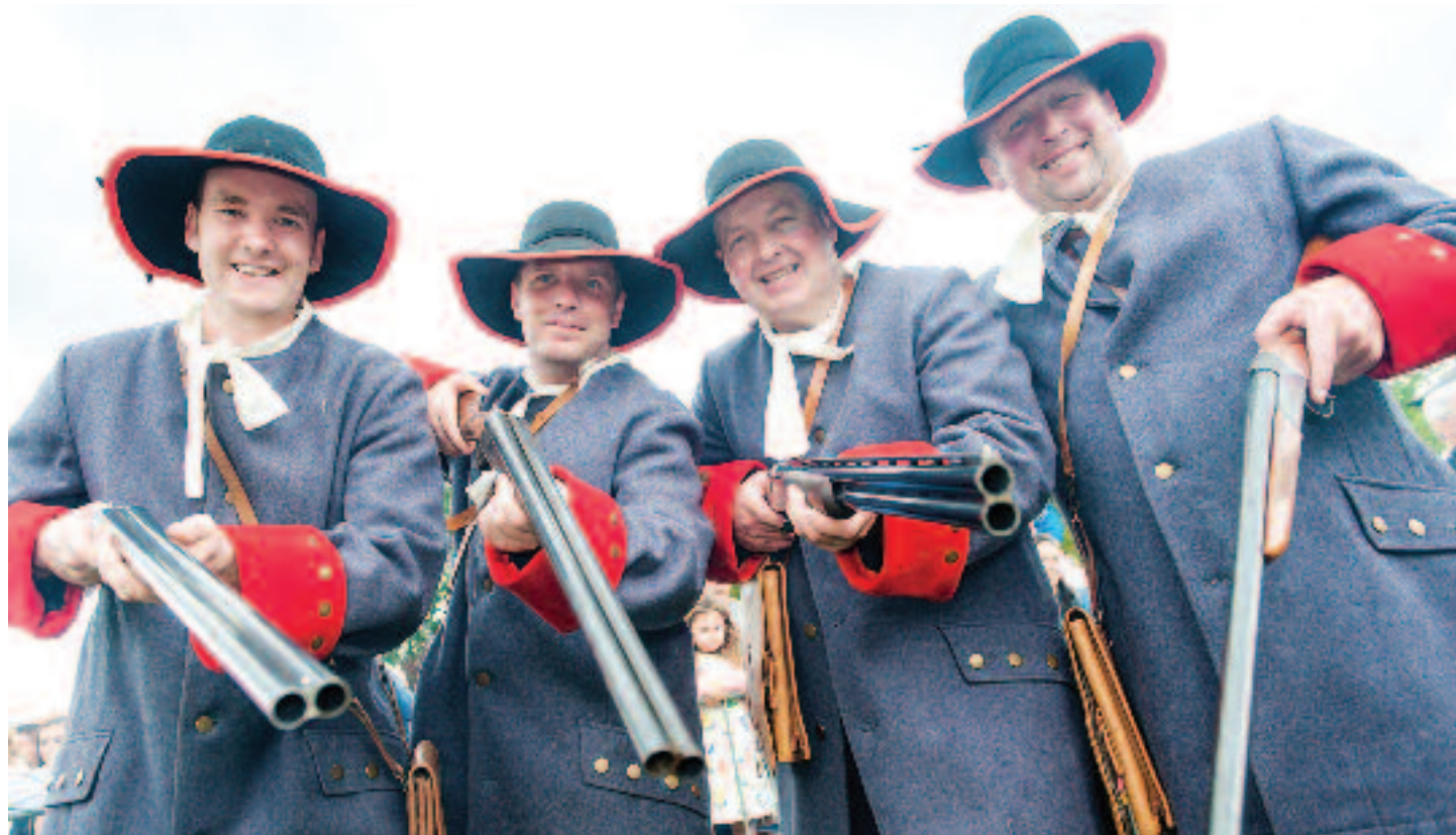
Foot soldiers taking part in the Scarva Sham Fight.