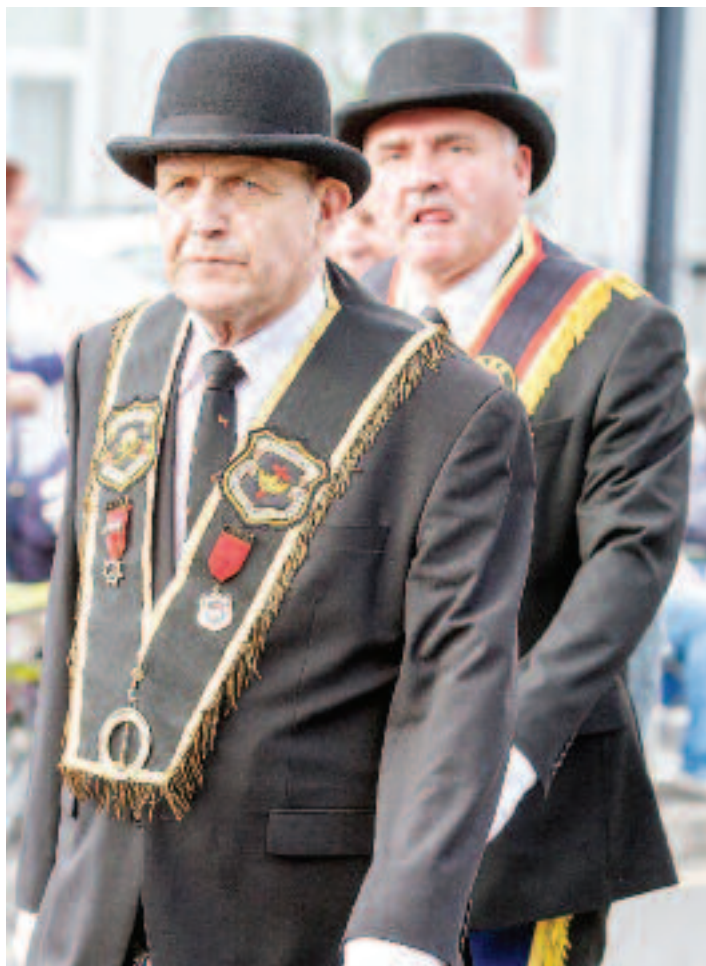
Members of the Royal Black Institution from England in attendance.