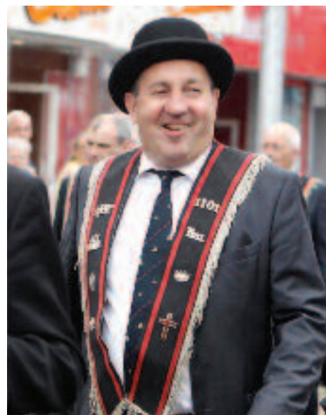
The Last Saturday in Aughnacloy & Omagh P22 & P23