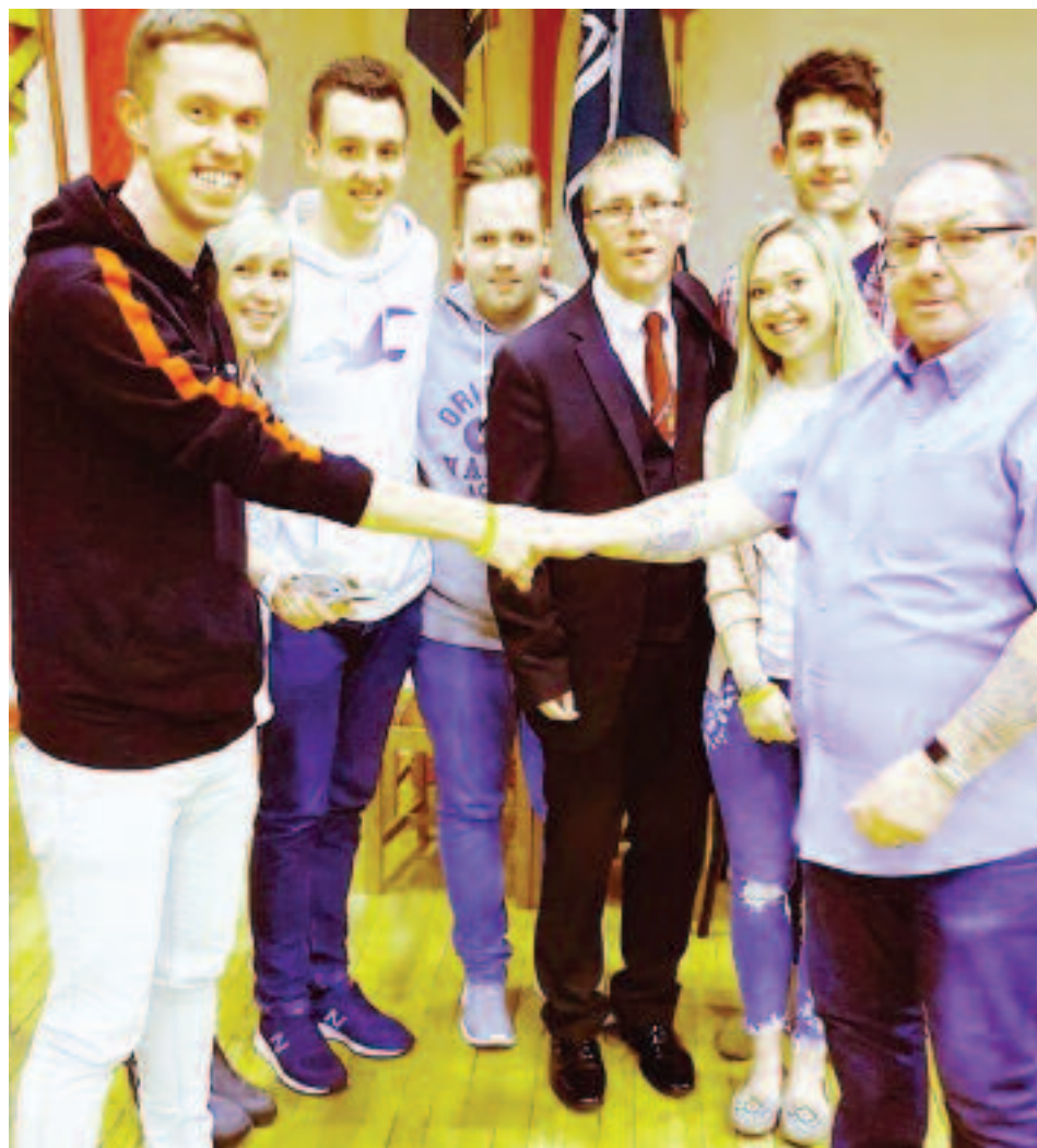
the proceeds of a charity quiz, held by Ballymacarrett Grand Black Chapter, in aid of their Christian outreach trip to Tanzania