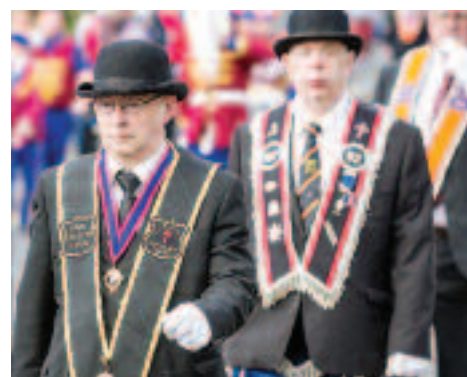
Senior Sir Knights from Belfast on parade.