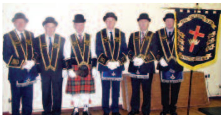
Castlederg Royal Black District Chapter No 6 recently held their anniversary service and parade in Derg Parish Church, Co Tyrone. During the service, new