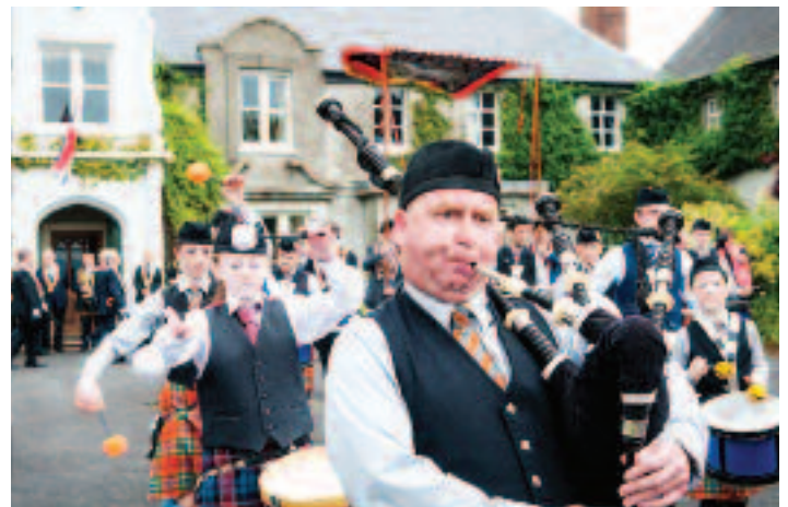
One of a number of pipe bands taking part in Scarva.