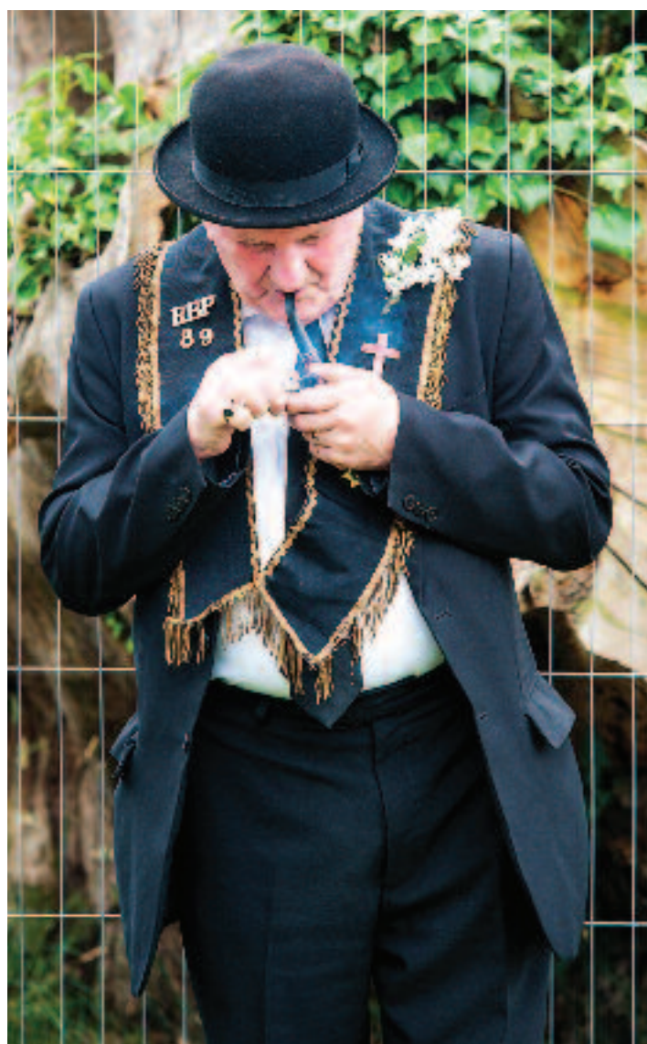
A Sir Knight puffs on his pipe during a break.