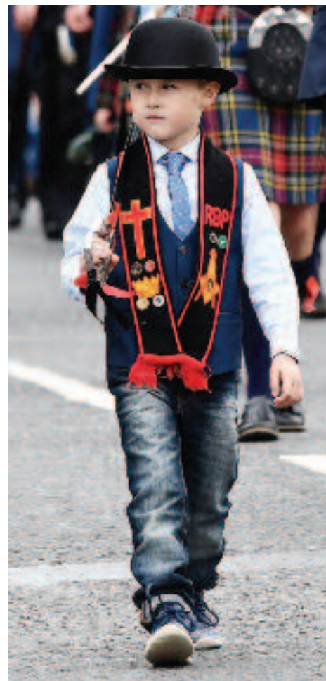
A young boy turned out in regalia and a bowler hat