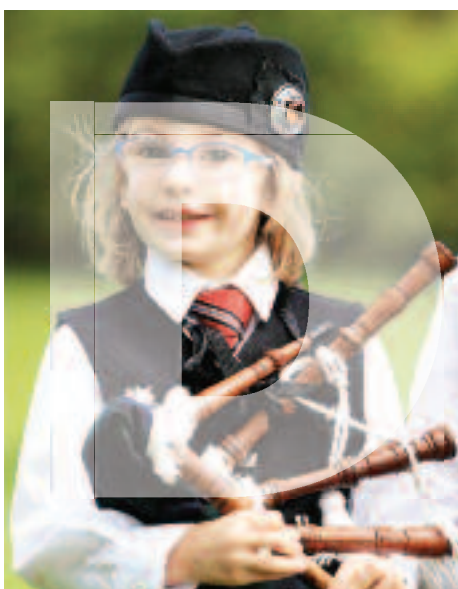
Parade in Fermanagh P32