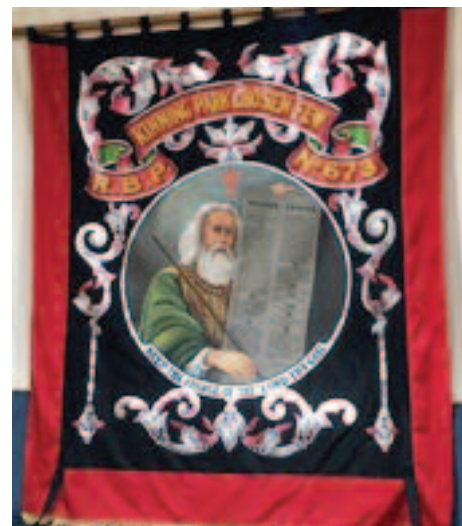
The banner portraying Moses and the Ten Commandments.

RBP 673 is encamped in the Orange Halls, Lorne Street Glasgow and is part of Govan Royal Black Chapter No7.