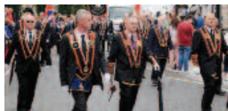
RBP 229 pictured at the Last Saturday parade in Lisburn.