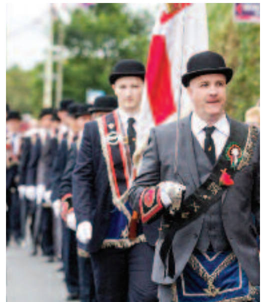
The Royal Black parade included 35 preceptories