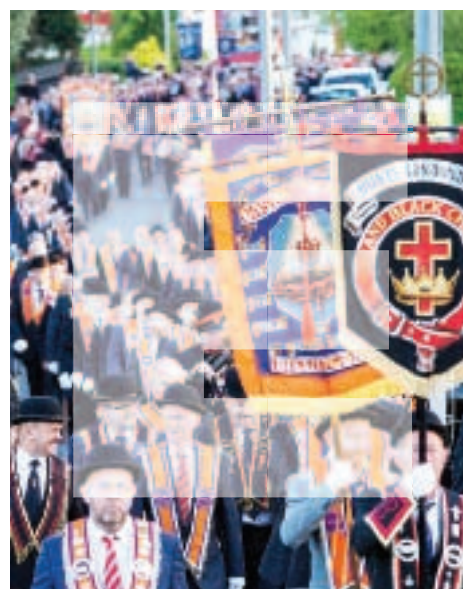
Luther 500 Rally in Portadown P34 - P39