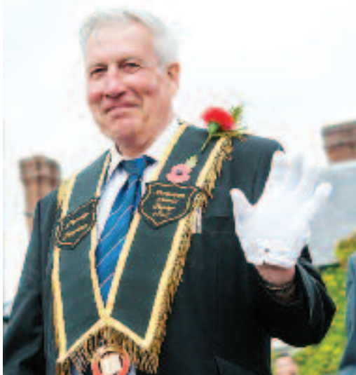
A Sir Knight waves at the camera.