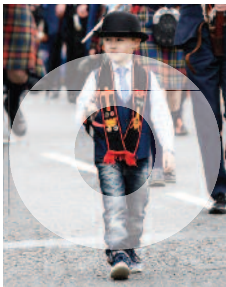
The Last Saturday in Comber P18 & 19