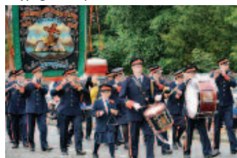
Volunteers RBP 286 lodge.