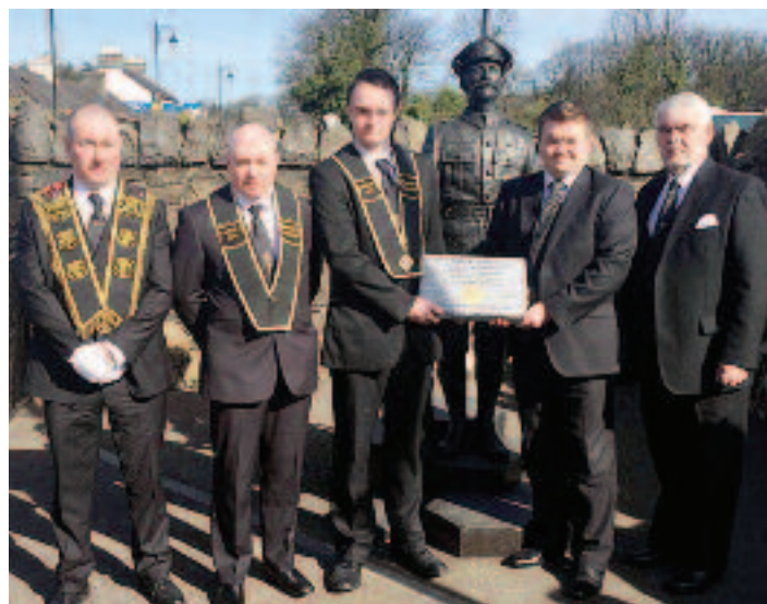
Members of the preceptory present an inscribed stone tablet to the local Causeway lodge.