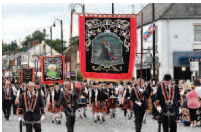
Waringsford Golden Star RBP 51 making their way through Comber