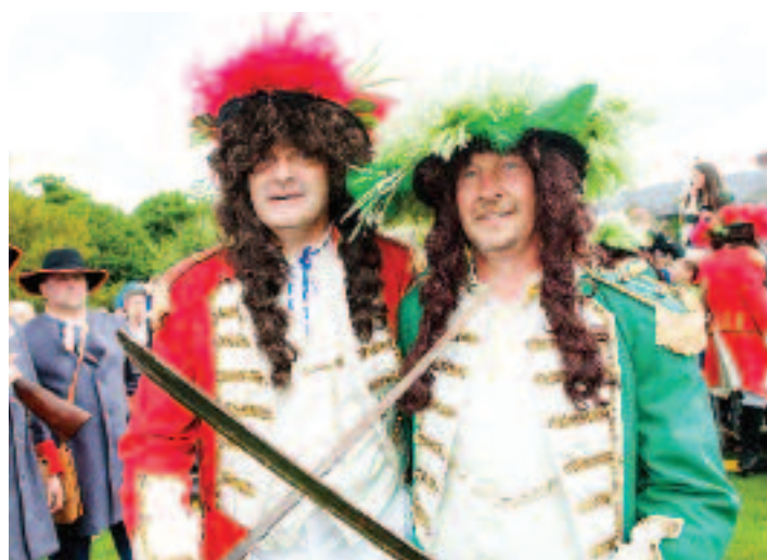
King William and King James face off ahead of the Sham Fight.