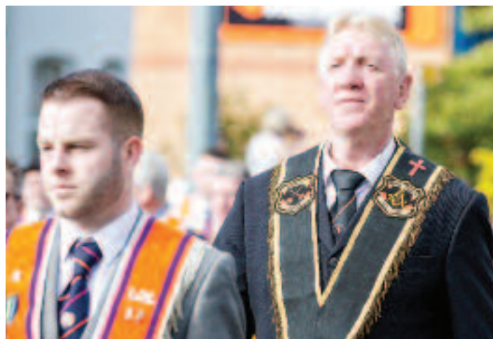
Sir Knights joined with Orangemen for the Portadown procession.