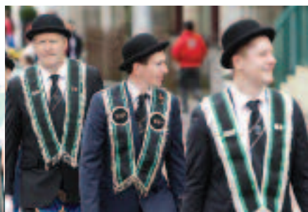
Sir Knights from RBP 58