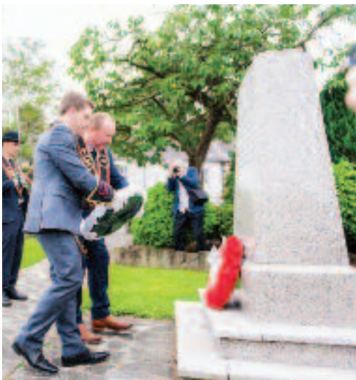
Members of RBP 1000 pay their respects at the village memorial prior to the main Scarva parade.