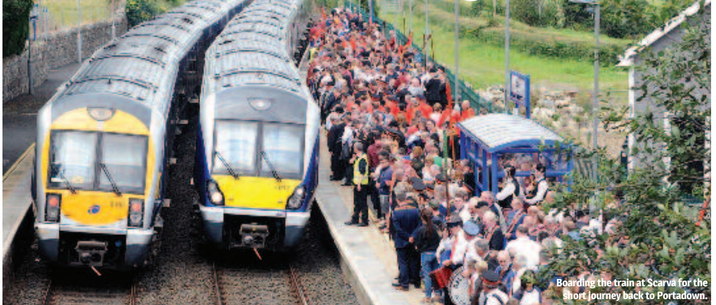
Boarding the train at Scarva for the short journey back to Portadown.

M assive crowds enjoyed one of the largest cultural events in Northern Ireland's calendar as Scarva once again played host to its annual Sham Fight.