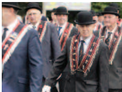
Up to 80 preceptories took part in the Aughnacloy demonstration