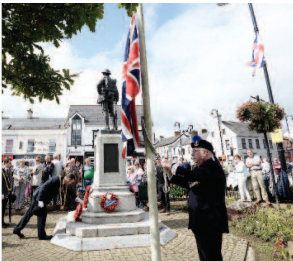
A wreath is laid at the town's war memorial