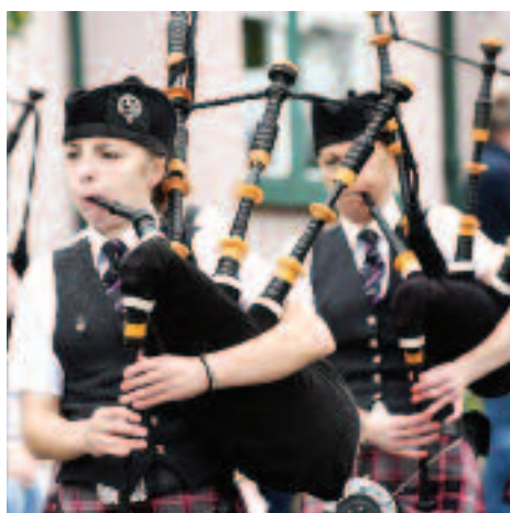
Pipers on parade