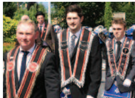
Sir Knights with RBP 549, taking part in The Co. Fermanagh Grand Black Perceptory Celebrations.