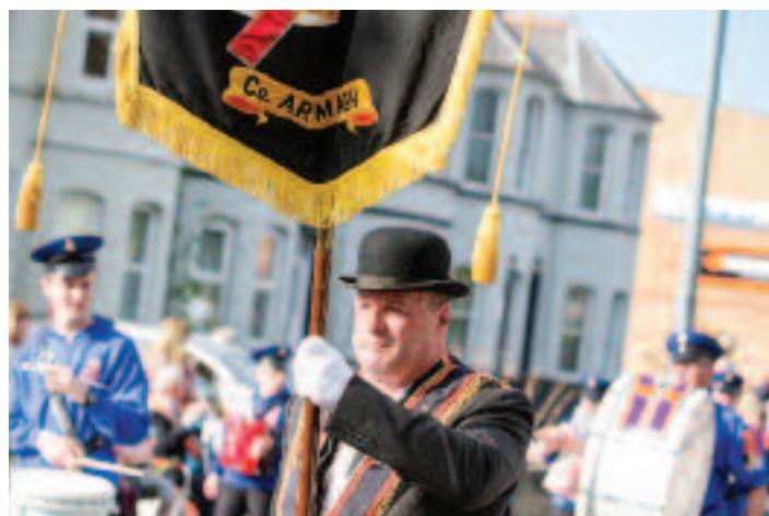
A Sir Knight on parade.