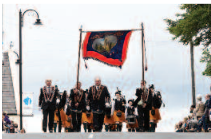
Sir Knights come into view