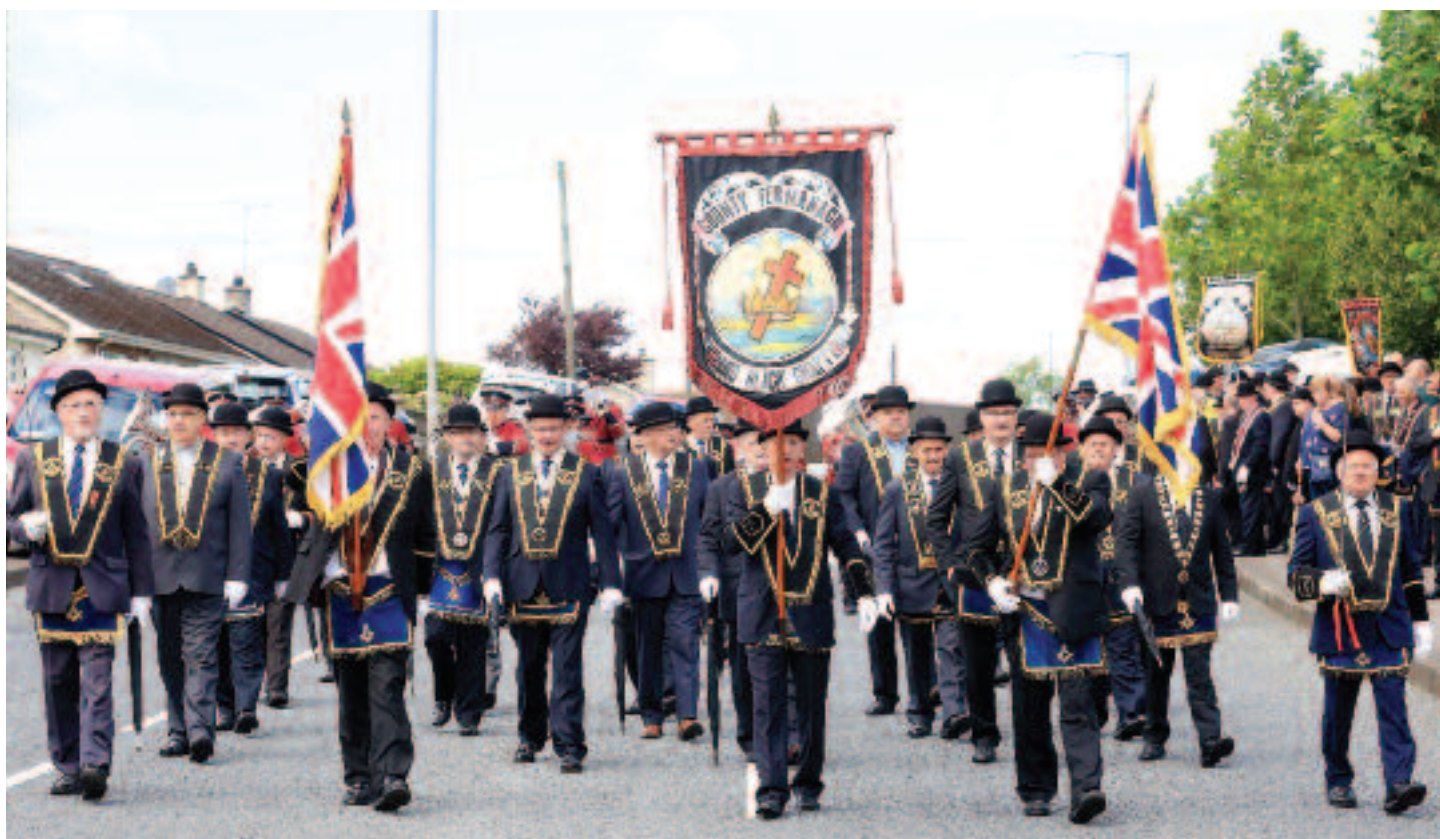
Co.Fermanagh Grand Black Perceptory during their Twelfth Celebrations in Lisnaskea.