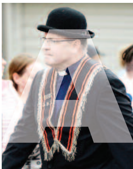
Parade in Bangor P31