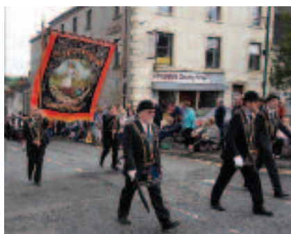
Sir Knights from County Cavan on parade