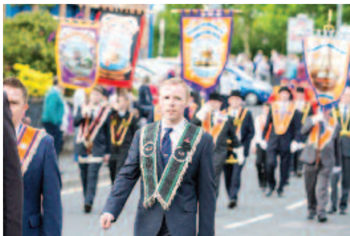
A young Sir Knight on parade in Portadown.