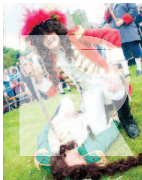
The 13th July in Scarva P26 - 30