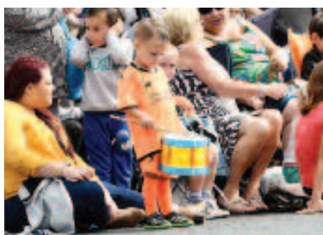
A young drummer showcases his skills