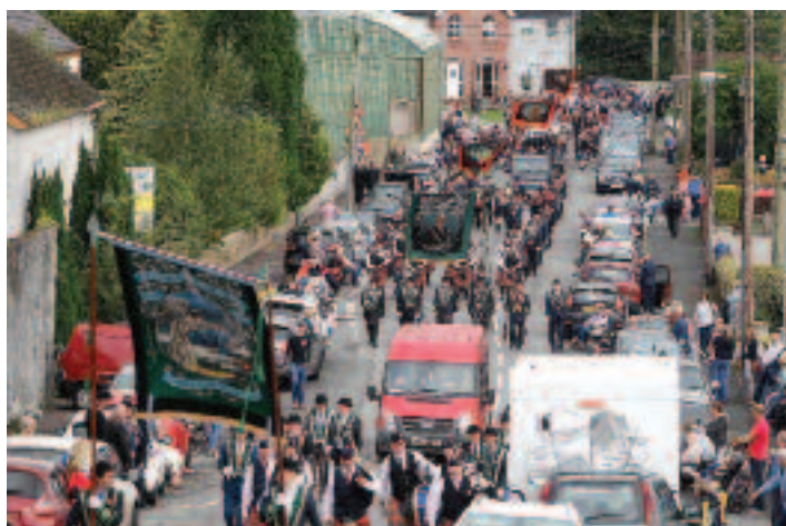
Preceptories and bands on parade in south Tyrone