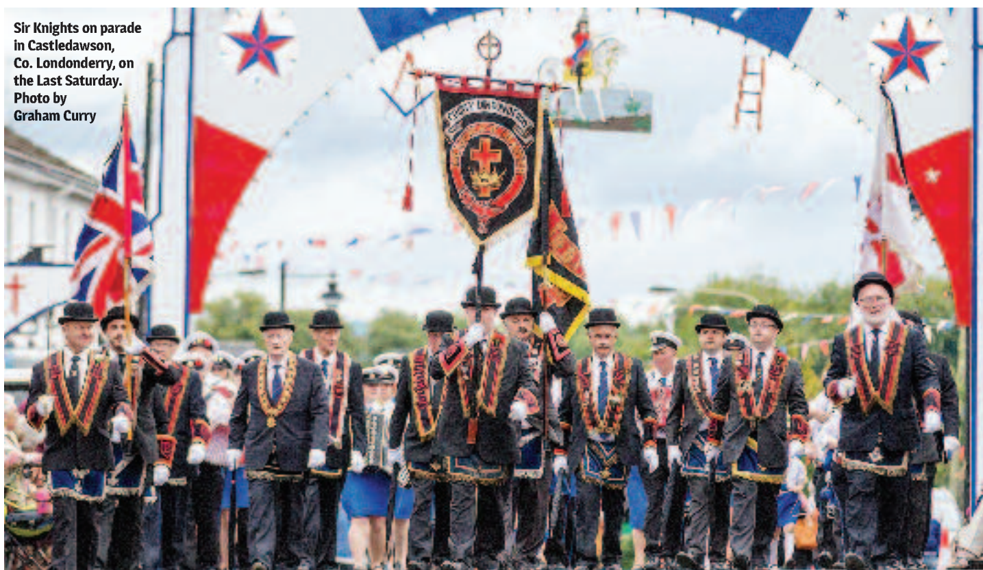
Sir Knights on parade in Castledawson, Co. Londonderry, on the Last Saturday.

Luther 500 Rally in Portadown - Pages 34-39