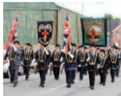
Killyman District stepping out