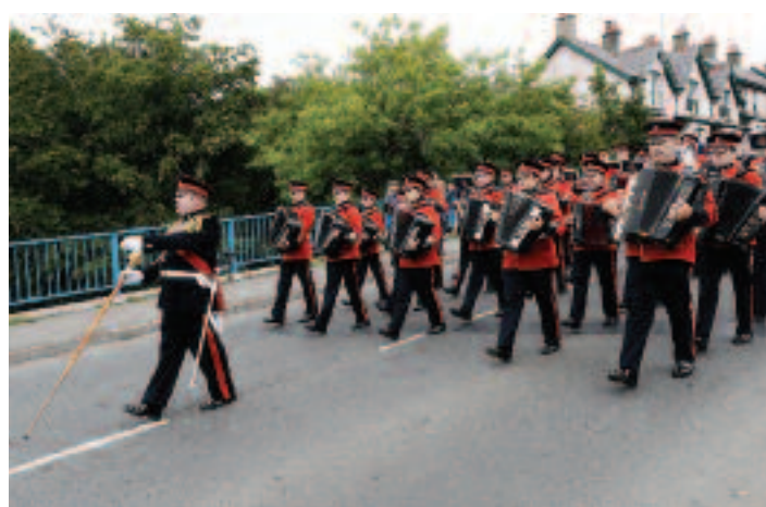
Brunswick Accordion Band in Comber