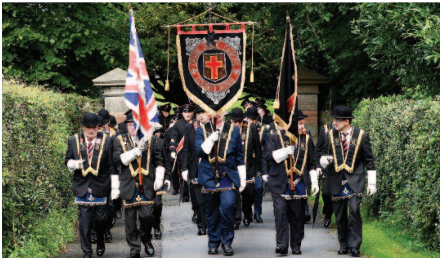
The head of the County Down parade stepping out in Comber