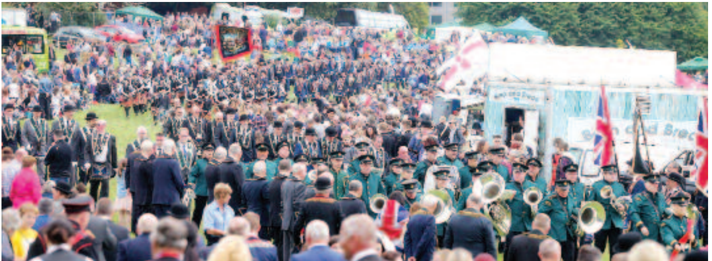
Tens of thousands descended on Scarva for the annual Sham Fight.