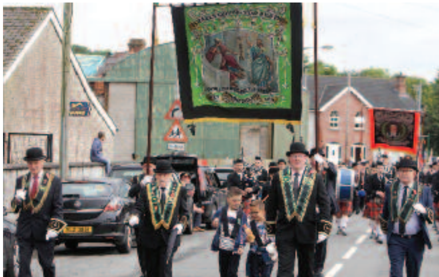
Israel's Guiding Star RBP 1001