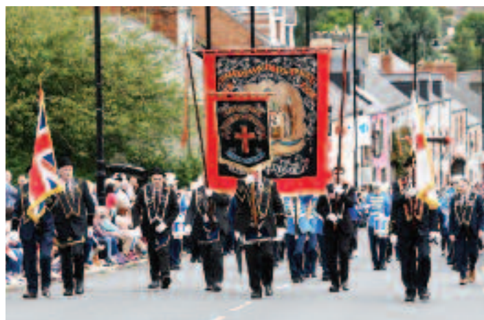
Castlewellan District Black Chapter on parade