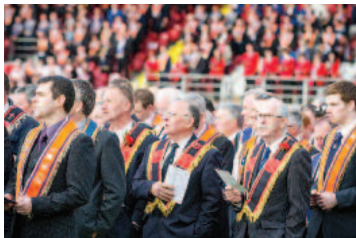
The act of worship at Shamrock Park.