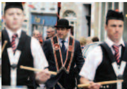
A member of RBP 76