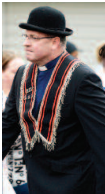
A Sir Knight and clergyman on parade.