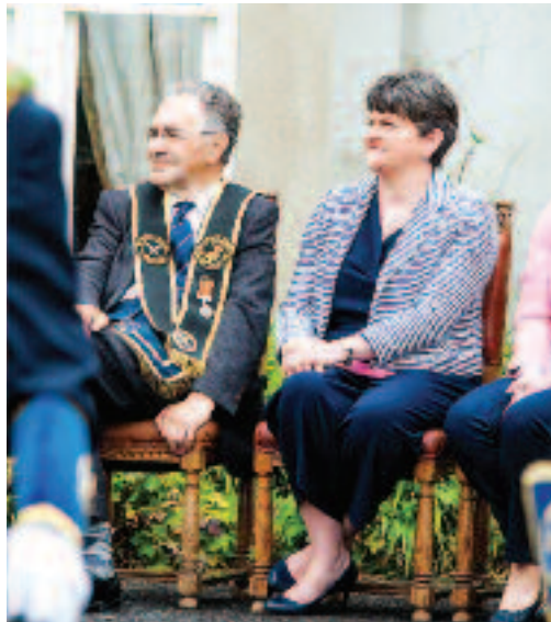
DUP leader Arlene Foster MLA watching the parade.