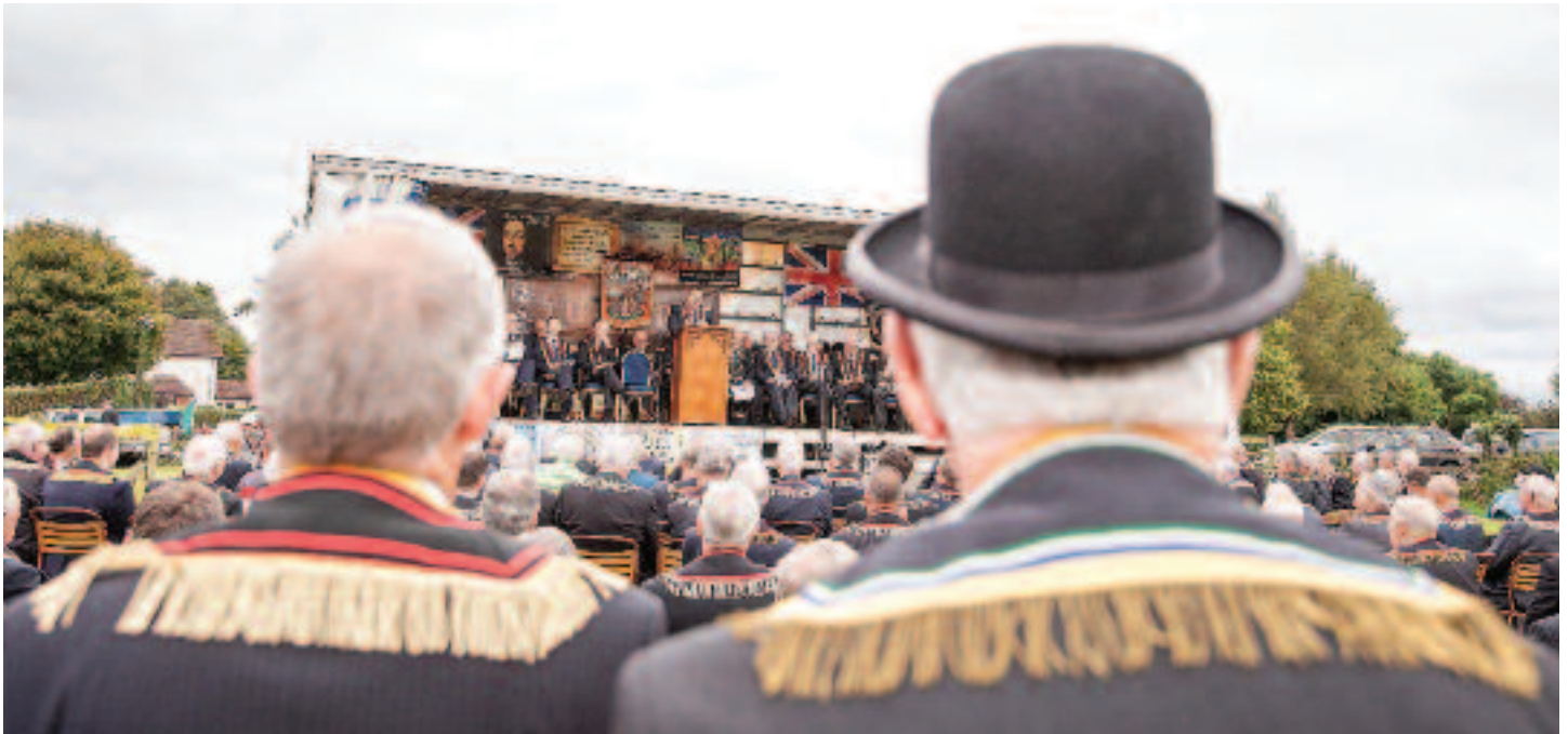
, 2 1 21