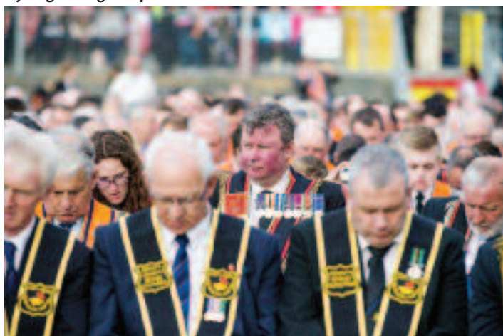
Sir Knights among those participating in the religious service.