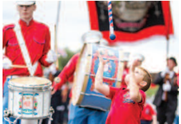
A young bandsman taking part in the parade