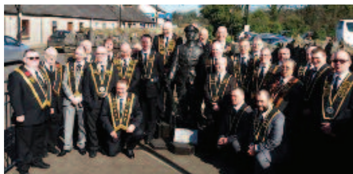
Sir Knights from RBP 375 at the Quigg statue in Bushmills.