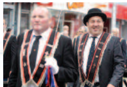
A smile to the crowd from a member of RBP 1101