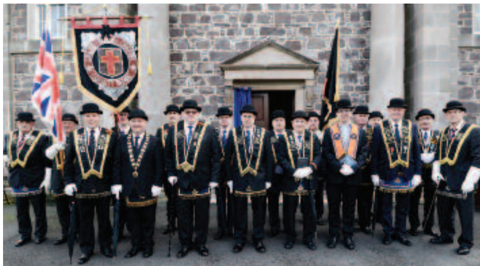
Senior County Down Sir Knights ahead of the main parade in Comber