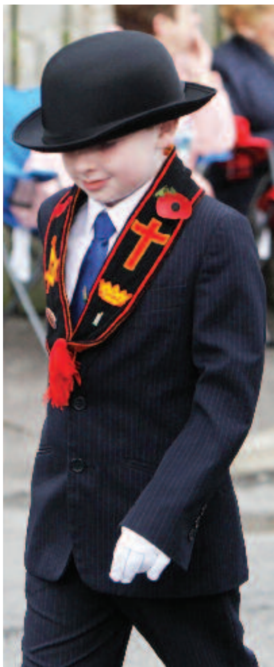
A young marcher dressed to impress