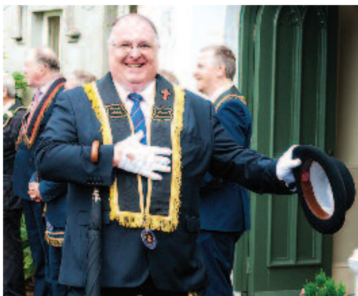
Sir Knights in jovial mood on parade.