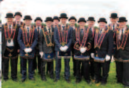
Mountjoy 'Burning Bush' RBP No 220