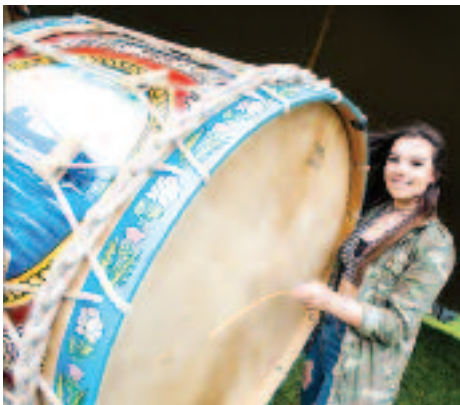
A young lady has a go on the Lambeg drum at the