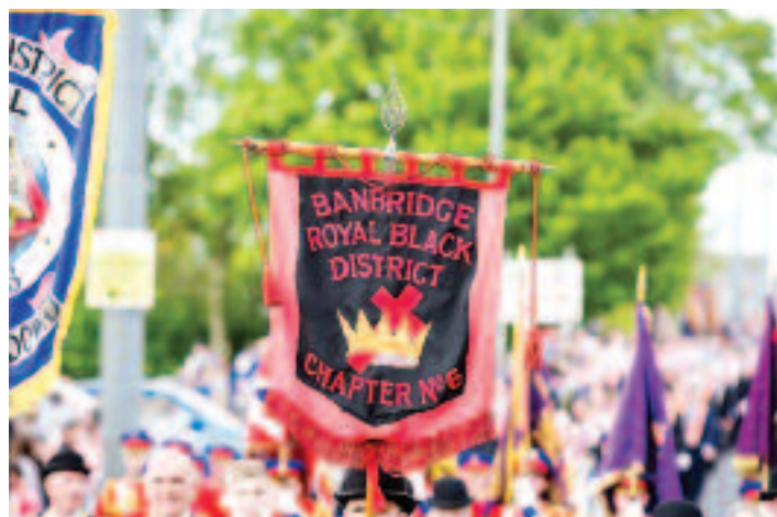
The bannerette of Banbridge Royal Black District.