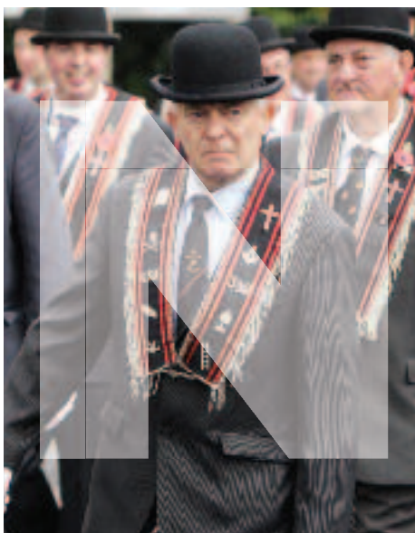
The Last Saturday in Antrim P20 & P21