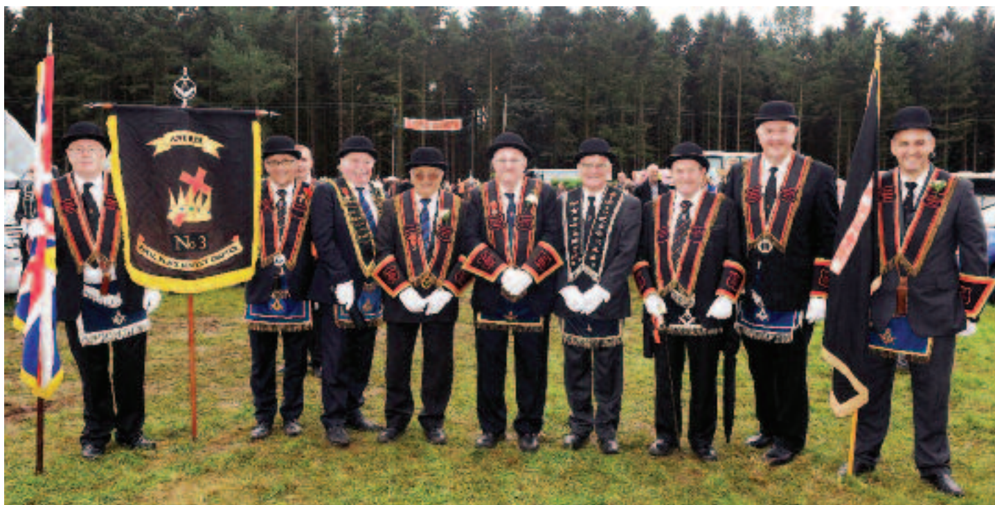
Antrim Royal Black District Chapter No 3 pictured at the Last Saturday demonstration in Antrim.