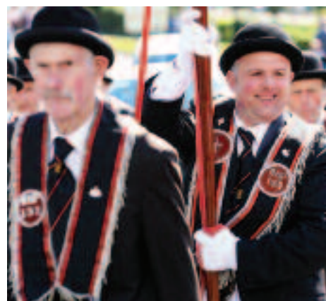
Sir Knights with RBP 132 enjoying the taking part of The Co. Fermanagh Grand Black Perceptory Parade.