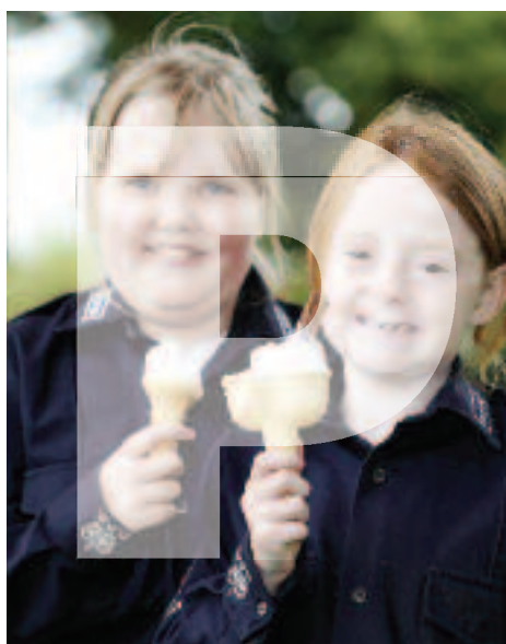
The Last Saturday in Lisburn P24