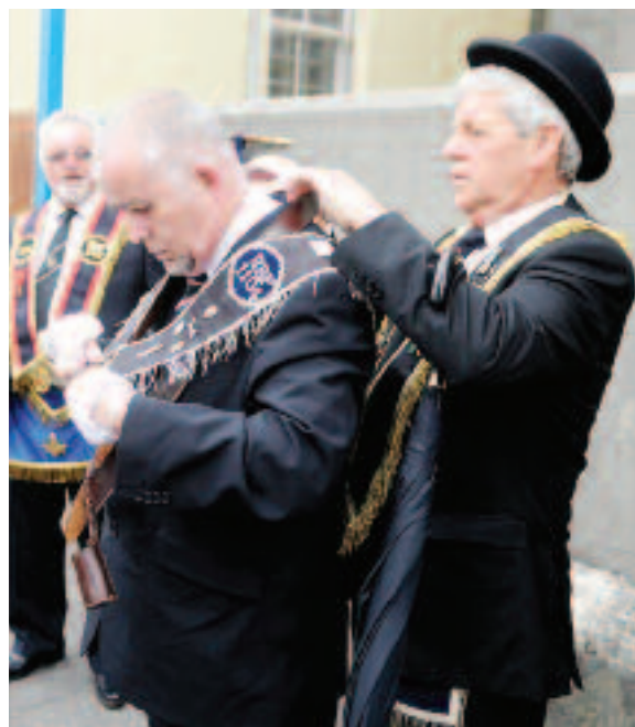
Final preparations are made ahead of the Bangor parade.