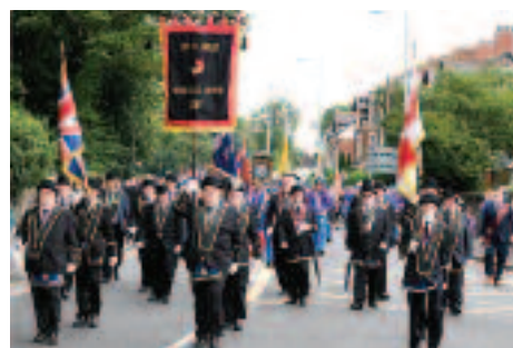
City of Belfast Grand Black Chapter held their demonstration in Lisburn