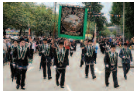
Elijah's Chosen Few RBP No 535 (Portglenone) pictured at the Last Saturday demonstration in Antrim.