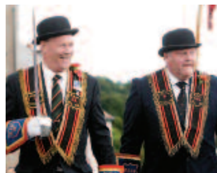
Sir Knights enjoying their day out