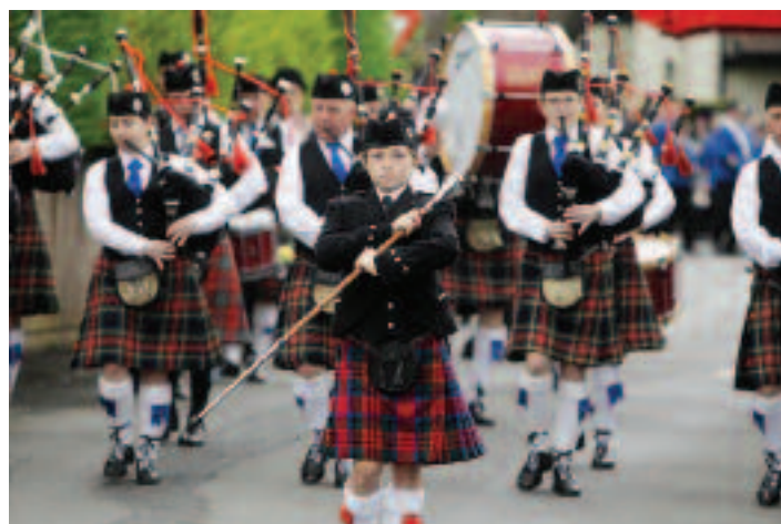
A female drum major leading from the front