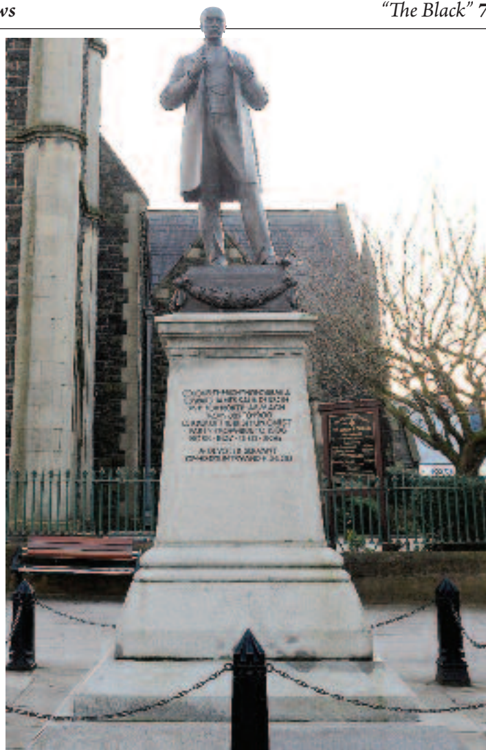
The Colonel Sanderson Statue in Market Street, Portadown