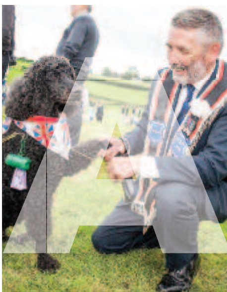
The Last Saturday in Castledawson P25