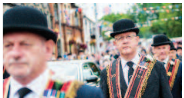
Sir Knights from RBP 133 stepping out in Scarva.