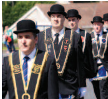
Sir Knights taking part in The Co. Fermanagh Grand Black Perceptory Parade.