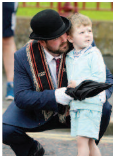
A Royal Black member offers some words of reassurance to a young boy.