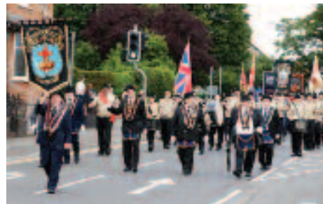
Sir Knights from Sandy Row District