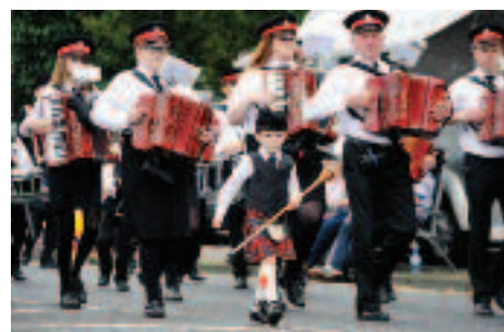
Stepping out in style.