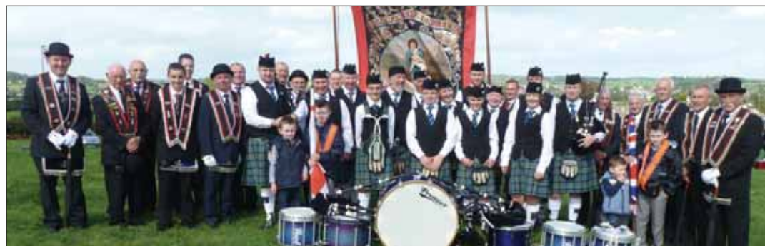
Pictured proudly together are Sir Knights of Reaghan "Chosen Few" RBP No 1101, Omagh District No 4 and members of Reaghan Pipe Band, which heads the Preceptory. RB109