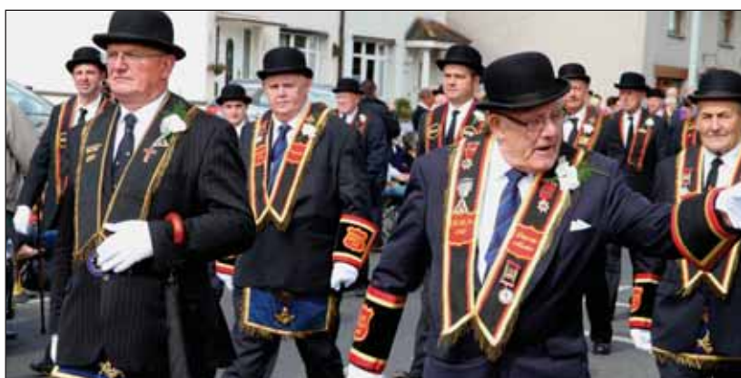
Sir Knights of Ballynenagh RPB 1112 Moneymore make their way to the field at Ballyronan. RB57