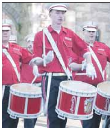
Above: drummers from the Sons of Ulster Flute Band, Newtownards. RB81