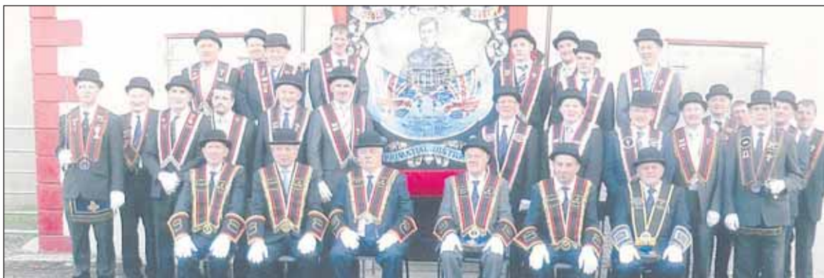
Young's Memorial RBP 1187 Madden, Primatial RBDC No 4, Co Armagh, pictured at the Last Saturday Demonstration with their recently unfurled new banner. RB91