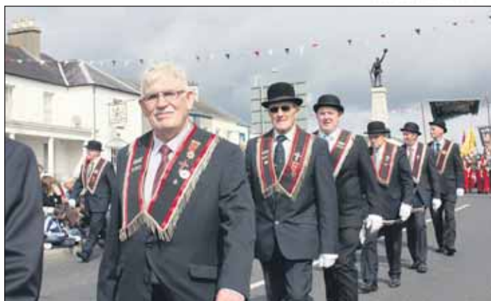
Sir Knights of Rising Star RBP 402 lead the way. RB58