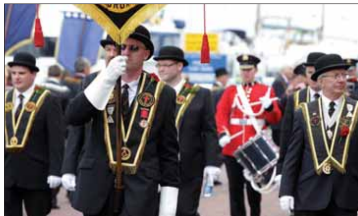
Lurgan RBDC No 2 Standard Bearer. RB29

LURGAN Royal Black District Chapter No 2's 12 preceptories were in Bangor for a parade on 13th July.