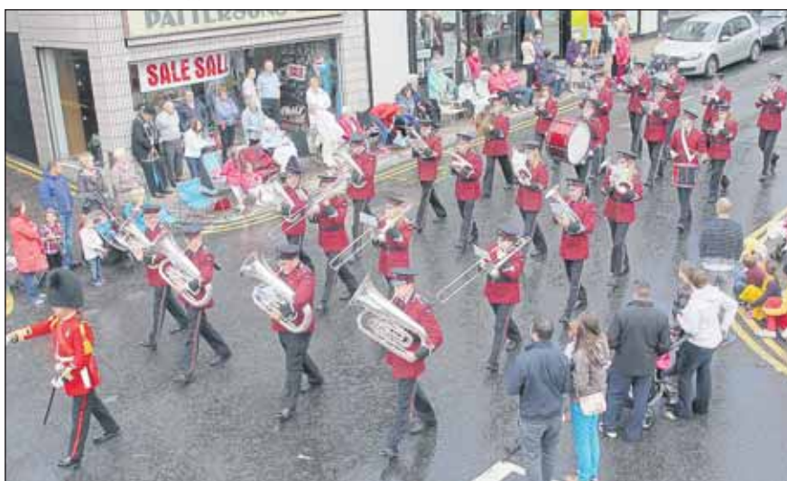
Churchill Silver band leads the procession through Dungannon. RB71