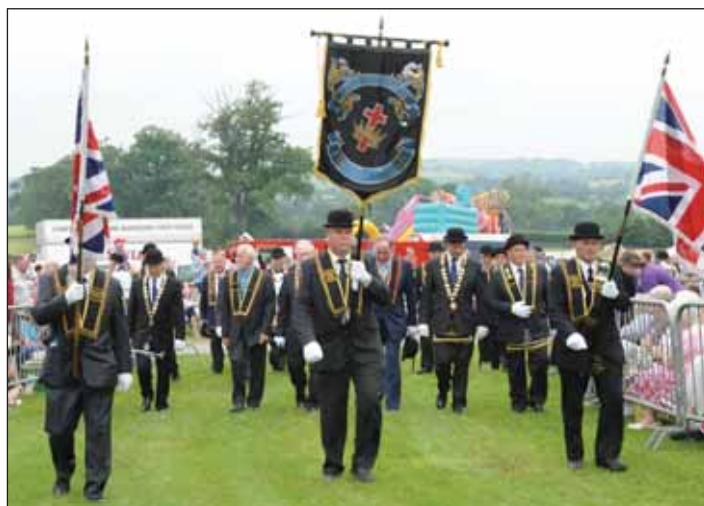
Grand Black Chapter of Armagh Colour Party pictured heading up the parade. RB13