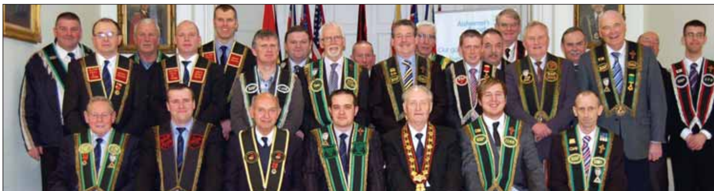
Bennett Memorial Temperance, Carricklongfield RBP No 1168, Aughnacloy, at its Election of Officers at Brownlow House. RB94