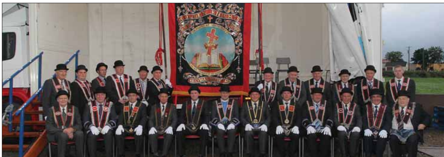
Derrycreevy "Golden Knights" RBP No 991 and guests at the Unveiling and Dedication of their new banner on 15th August. RB85