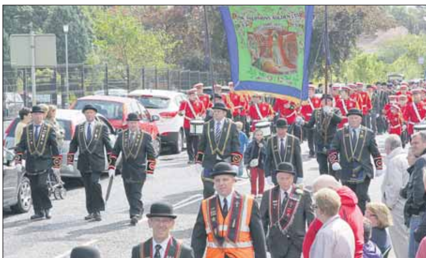
Magheraglass Flute Band and Sir Knights of Magheraglass RBP No 599 make their way to the Demonstration Field in Dungannon. RB73