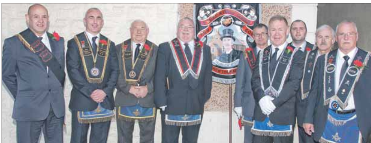
Members from the Rev Thomas McIlwrath Memorial RBP No 606, Newtownards. RB78

Sixty preceptories were on parade, including 2,300 members of the Institution. They were accompanied by 33 bands.