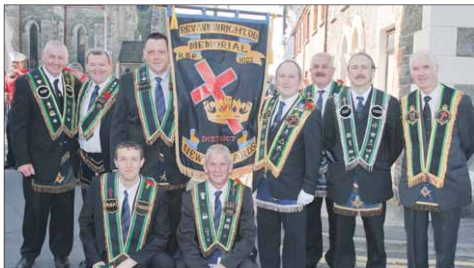
Right, Sir Knights of the Rev William Wright Memorial, RBP No 1022, Newtownards. RB80