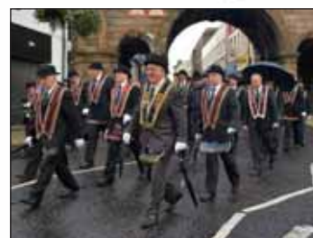
Sir Knights on parade in Londonderry, UK City of Culture. RB6