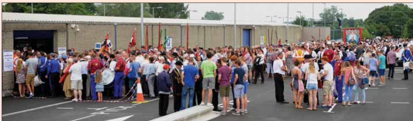
The large crowd at Portadown Train Station queuing for the train to Scarva for the annual Sham Fight Demonstration. RB11.