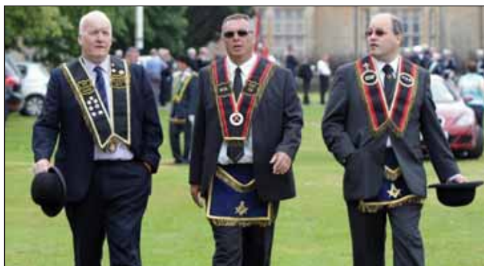
Sir Knights taking a break in Bangor. RB27