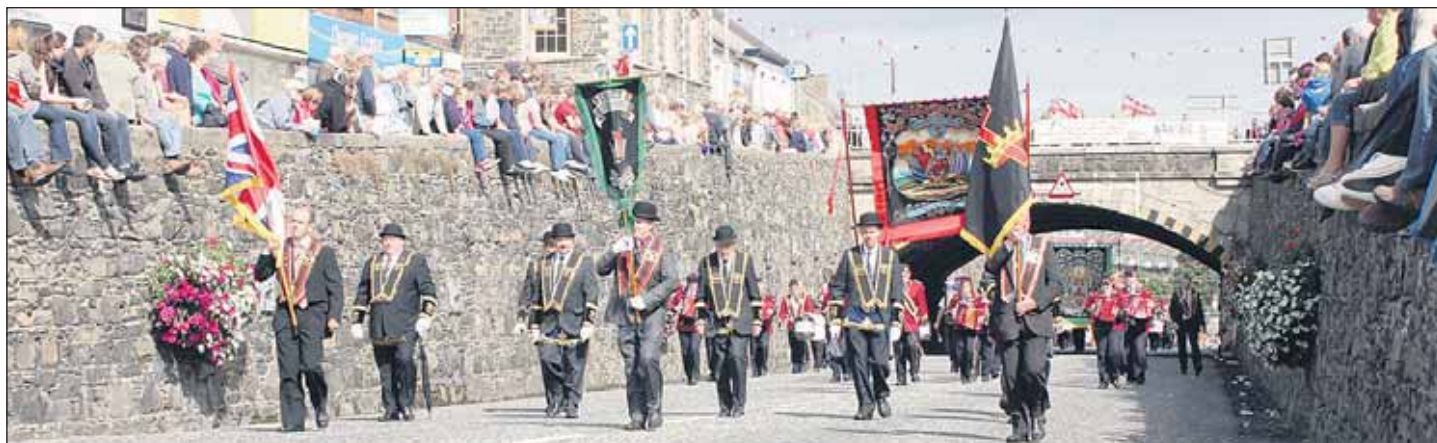
Parading in picturesque Banbridge. RB60