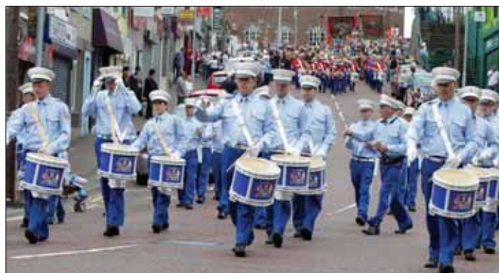
A colourful parade through Bangor town. RB28