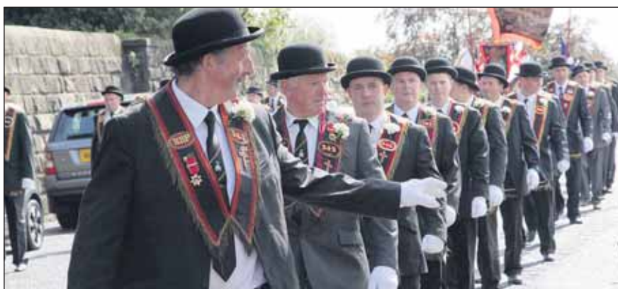
Hello there! Sir Knights RBP No 343. RB72