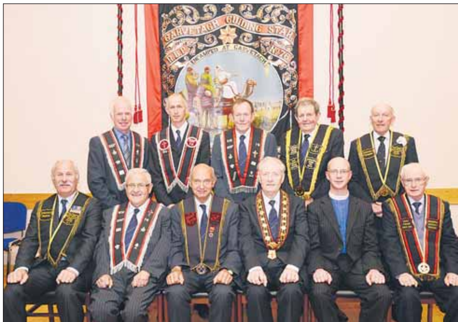
Right: Officers and members of Garvetagh Guiding Star RBP No 76 pictured following the unfurling ceremony and dedication of their new banner in Garvetagh Orange Hall. RB87