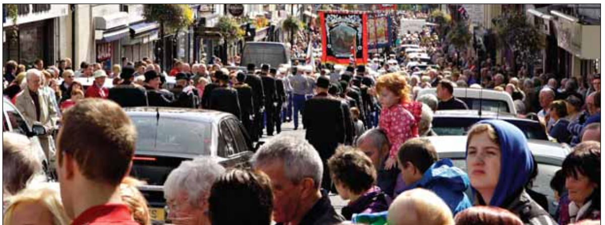
A packed Main Street in the sunshine for the County Antrim RBP parade in Ballymoney.