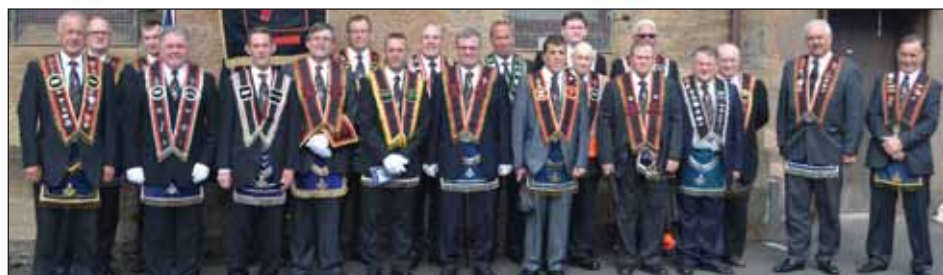
Bellshill's Chosen Few RBP No 475 members and visitors from Glenavy Red Cross Volunteers RBP No 286 before taking part in a parade in Bellshill on 10th August 2013. Bellshill is situated between Glasgow and Edinburgh and the Preceptory belongs to the Airdrie and Coatbridge District No.3 of the Provincial Grand Black Chapter of Scotland. RB115