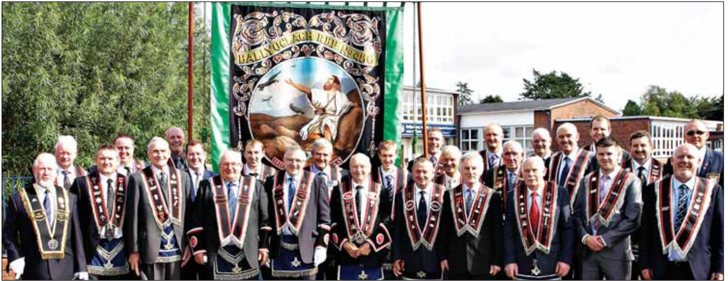
Officers and Sir Knights of Ballyoglagh RBP No 486 in Ballymoney. RB47