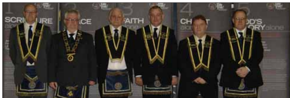
The Royal Black Institution's "Take Five" Exhibition visited The Lothians RBDC No 9's District Chapter meeting in Scotland. There was also a Royal Arch Purple Degree and booklets were handed out to around 80 Sir Knights. The Lothians' Grand Trustees and Chaplains will be looking at future dates to take the exhibition on the road. Pictured are District Officers and the Past Grand Master. RB116