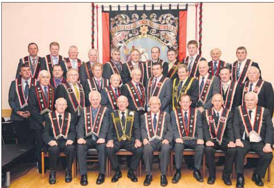
Left: Officers and guests of Garvetagh Guiding Star RBP No 76 pictured following the Unfurling and Dedication of their new banner in Garvetagh Orange Hall. RB89

Depicted on the new banner are the Biblical scenes of "The journey of the Wise Men" and "Abraham and Isaac".