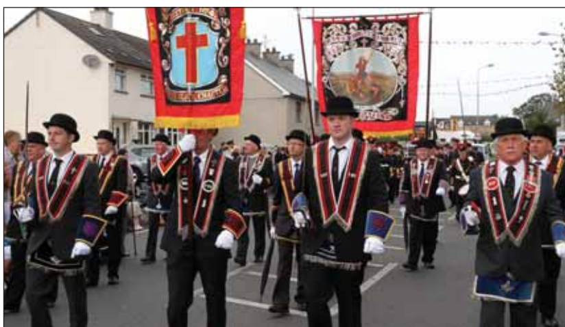
Officers of South Londonderry District Number 4 on parade in Ballyronan. RB53