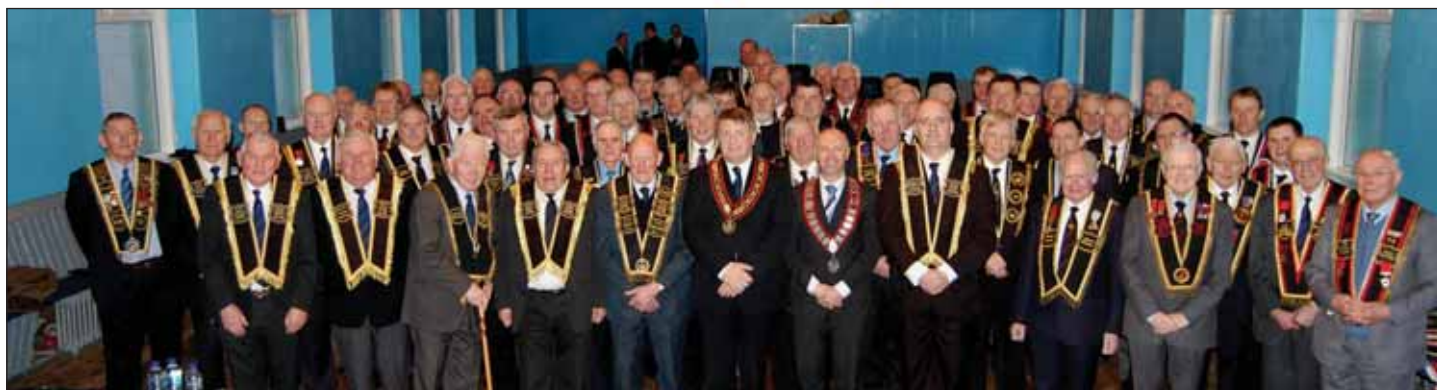
Guests at the Biannual Conference of Lecturers held in Ballynahinch Orange Hall. RB107

COUNTY Down Grand Black Chapter met in Ballynahinch Orange Hall for its biannual Conference of Lecturers.