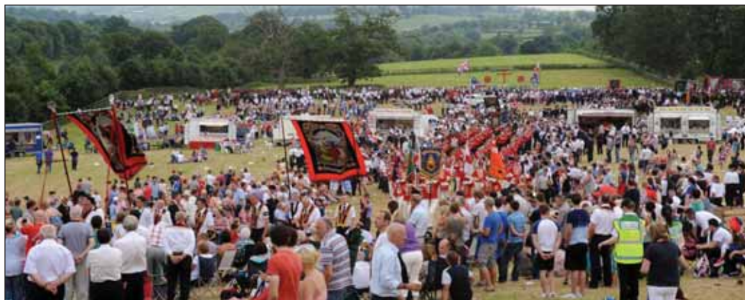
The packed Demonstration Field. RB12

The Scarva procession left the assembly field on the Gilford Road. Eighty Preceptories of the Royal