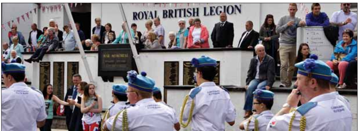
Getting the best vantage from the balcony of the Royal British in Ballymoney for the parade. RB49