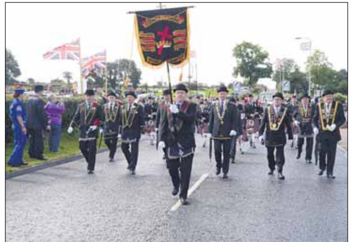
The County Tyrone bannerette leads the head of the parade along the Castlegore Road during the Royal Black Institution 'Last Saturday' parade in Castlederg. RB67

Below: members of the Pride of the Derg Flute Band, Castlederg, carry the "Help for Heroes" charity banner during the Royal Black Institution 'Last Saturday' parade in Castlederg. Band members also wore 'Help for Heroes' t-shirts on Saturday in support of the charity. RB68