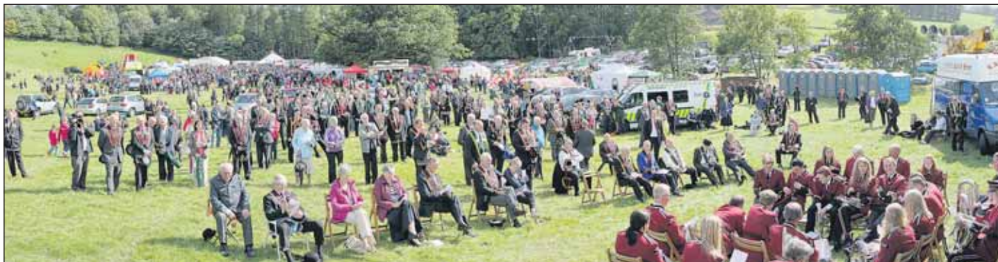
Gathering for the platform proceedings in Lord Northland Memorial Park. RB76