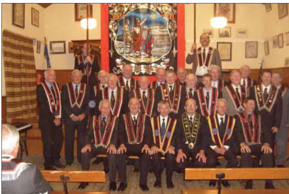
Right: Sir Knights of Blackhill RBP 71 and guests with their new Preceptory banner. RB83

At the conclusion, everyone enjoyed a lovely supper.