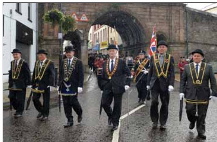
Royal Black dignitaries and Sir Knights taking part in the Londonderry Procession and Take Five Service which was held in Carlisle Road Presbyterian Church, Londonderry on 15th September. RB5

A DVD of the event will be available to purchase at Royal Black Headquarters, Brownlow House, Lurgan.