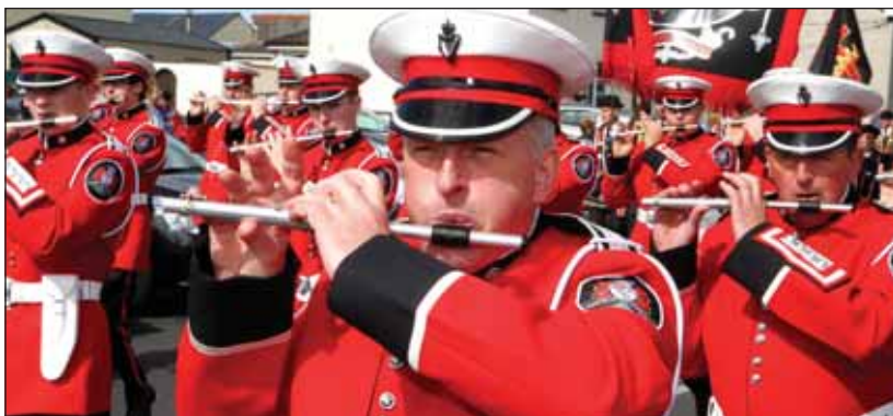
In tune at the Last Saturday in Ballyronan.