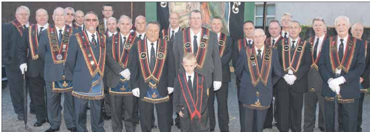
Members from Ards "Chosen Few" RBP No 290 at the Last Saturday in Newtownards. RB77