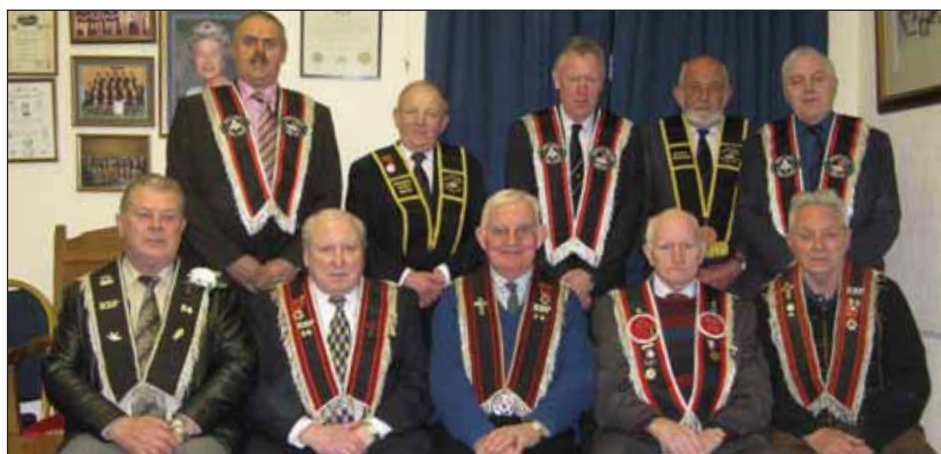
Long Service Jewels and Bars are presented for RBP No 54, Markethill Sir Knights. RB122