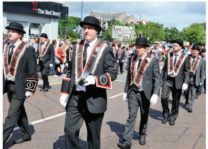
Members of RBP 353 enjoying the sunshine in Bangor.