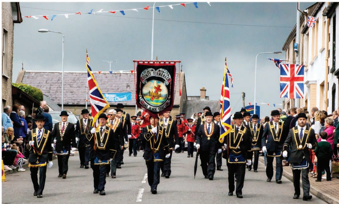
The head of the County Fermanagh procession in Maguiresbridge in August.