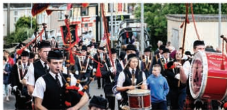
Drumharvey Pipe Band on parade at the County Fermanagh demonstration in Maguiresbridge.

"Those people were found not wanting in the challenge they faced and by their actions they brought peace and stability to a troubled world.