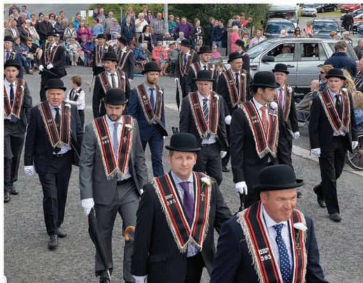
RBP 393.