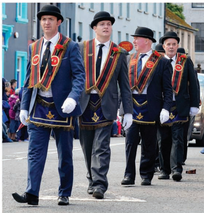
RBP 82.