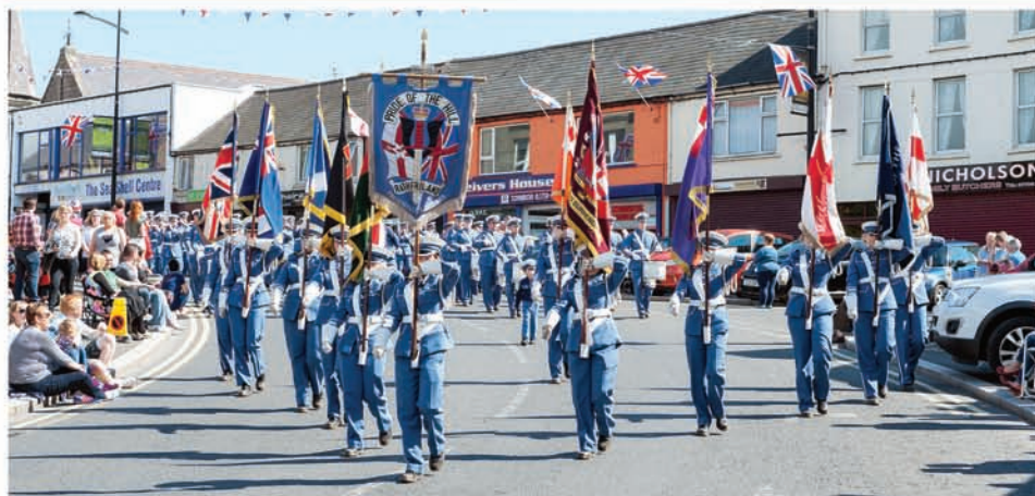
Pride of the Hill, Rathfriland on parade.