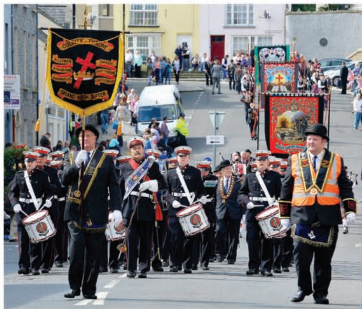
Co Tyrone leading the way down Main Street.