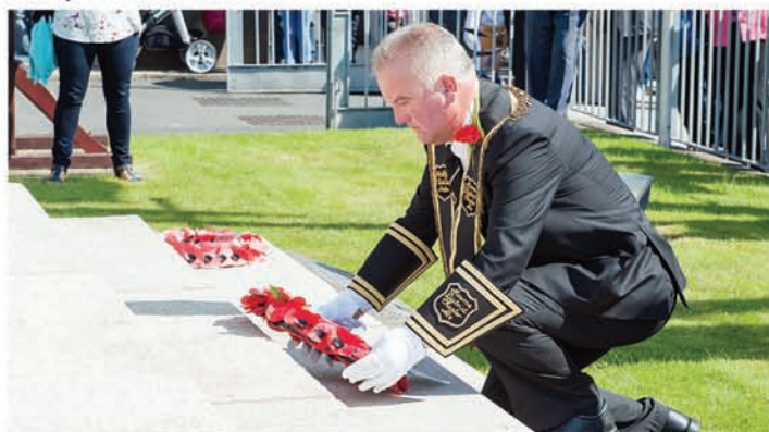
Worshipful District Master of Mourne laying a wreath at the cenotaph.