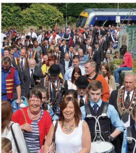
Crowds flocking off the train from Portadown.