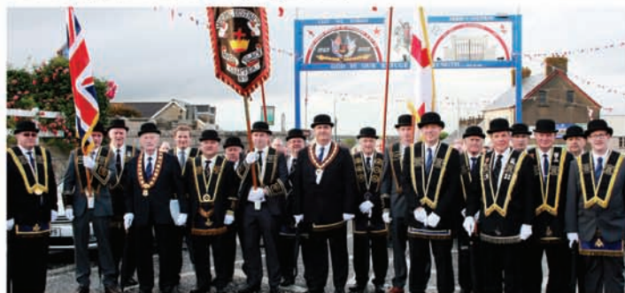
Officers pictured at the Arch in Annalong which has been changed to celebrate 150 years of RBP 34.