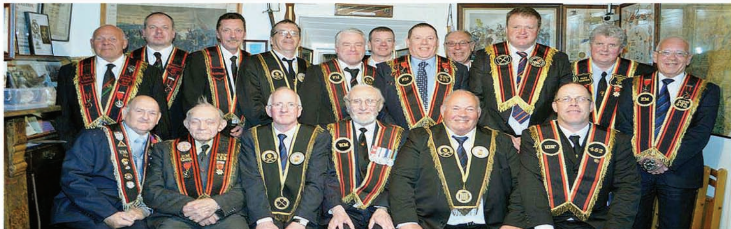
The members of RBP452, Lisburn, held their installation of officers at Dan Winter's Cottage.