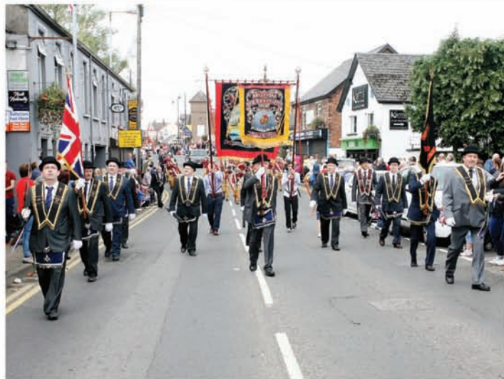
Ballymena Royal Black Chapter District No2 colour party on parade. GB3657D