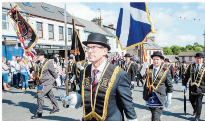
County Down District Officers