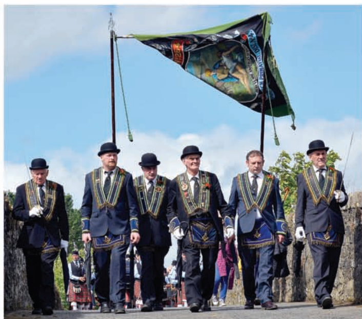
RBP 264 with banner flying high.