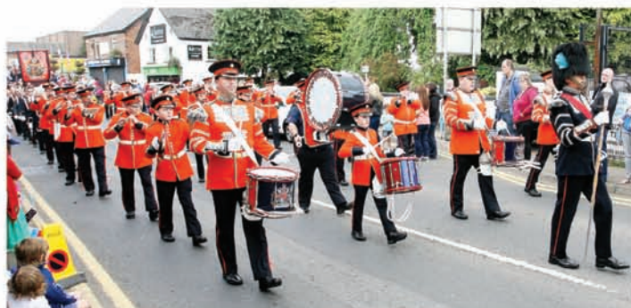
Sir George White Memorial flute band on parade. GB3659D