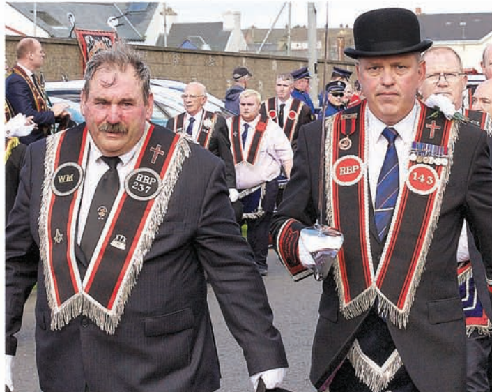
Sir Knights of RBP 237 and 143 pictured during Saturday's Royal Black Institution Demonstration in Portstewart. wk36074mb