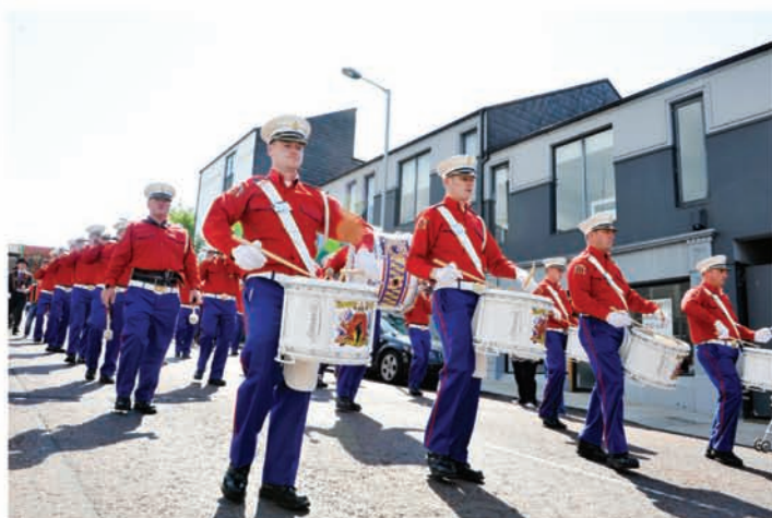
Eight bands joined the preceptories from Lurgan District for their annual parade in Bangor on July 14.