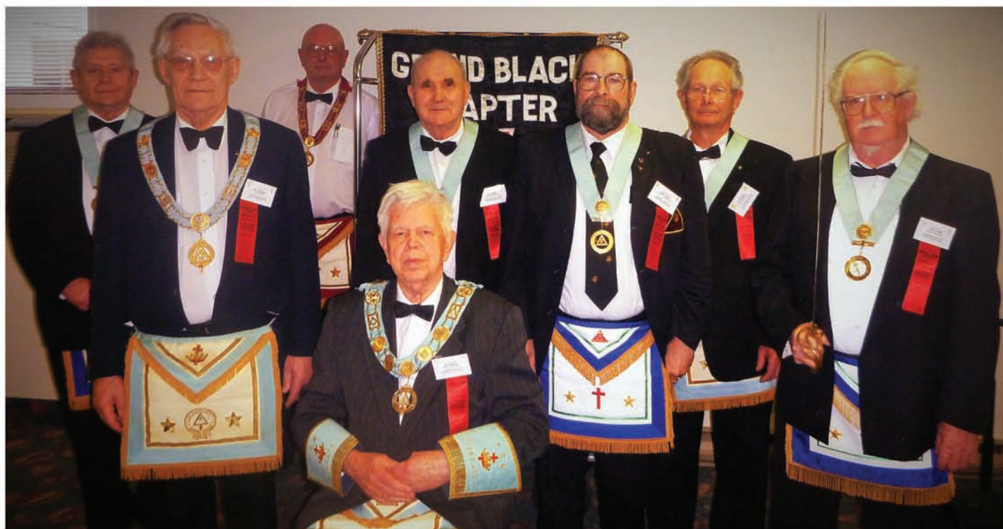
Officers of Eastern Ontario

The joint Red Cross degree of Toronto's The Temple RBP No292 (Ontario West GBC) and Kendal's Devitts RBP No398 (Eastern Ontario GBC) was conducted on Good Friday, 3rd April, 2015 in the Kendal Orange Hall.