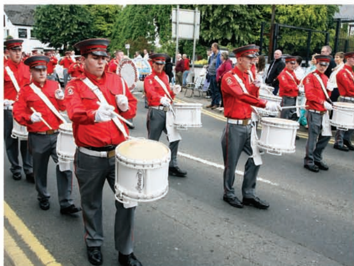
Loyal Son's of William Ahoghill. GB3658D