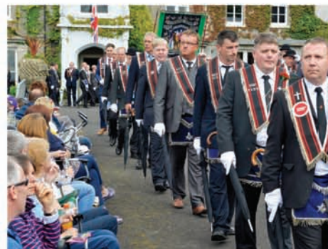
RBP 1133 on parade at Scarva Day.