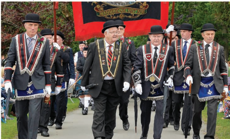
RBP No 402 proudly stepping out at Scarva.