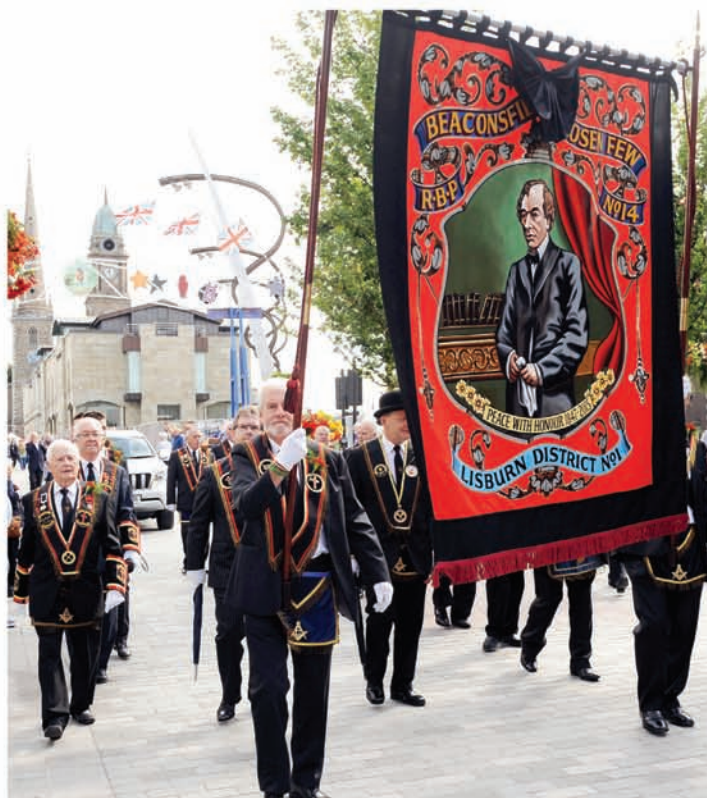
Beaconsfield Chosen Few RBP No 14 pictured giving their new banner it's first 'Last Saturday' airing at the County Antrim Grand Black Chapter Demonstration in Lisburn on Saturday 29th August.