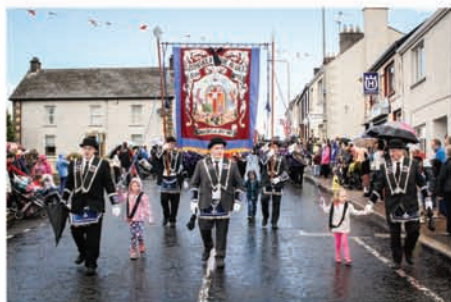
Braving the rain at the County Fermanagh demonstration.

He said, "By way of example, this year marks the 75th Anniversary of Victory in Europe Day, the day on which the conflict on this continent ended. This was only achieved by the service of men and women in the Armed Forces and the sacrifice was where many of them gave their lives to achieve that goal.