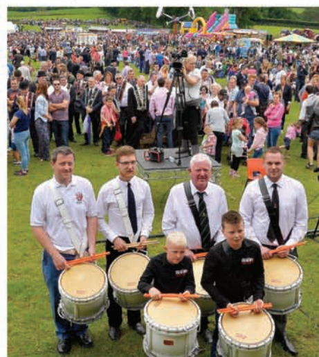
The Drummers who entertained a large crowd in the field.