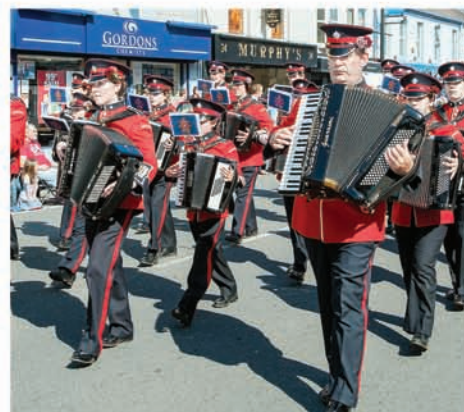
On parade in Kilkeel.