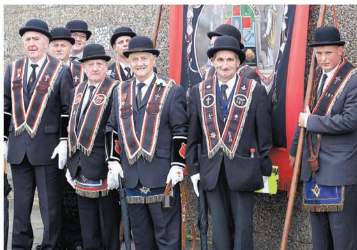
Sir Knights of Ballywillan RBP 157 pictured waiting for the start of proceedings at Saturday's Royal Black Demonstration in Portstewart. wk36065mb