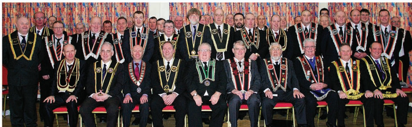
The Sir Knights who attended the historic event in Doncaster to witness the inception of two new preceptories and the reconstitution of the Manchester and North East of England District Chapter No.4.