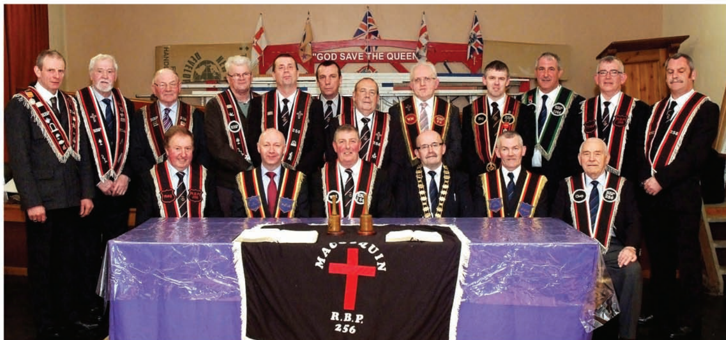
Macosquin Smith's Defenders RBP 256 Officers along with the installing team at their installation night on Monday 30th March 2015