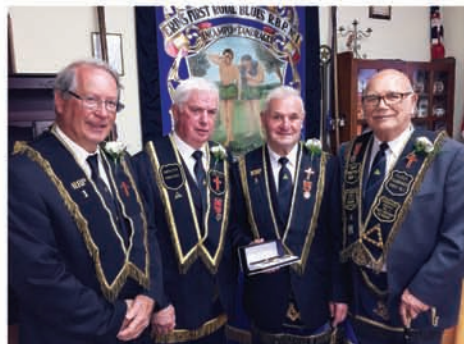
Erin's First Royal Blues R.B.P. No 1 Presentation on 14th July 2015.