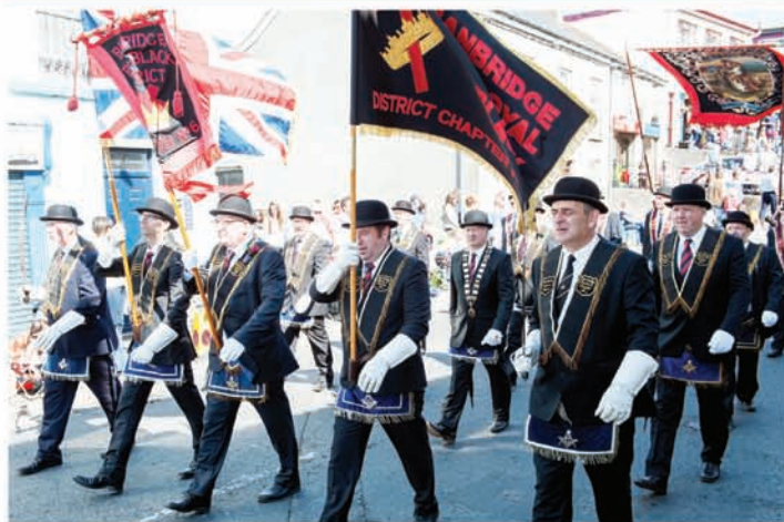
Banbridge District Chapter No. 6