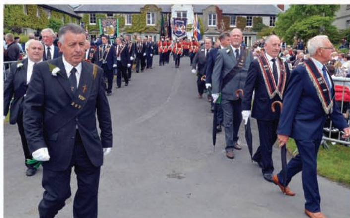
RBP's 267 &amp; 502 on Parade at Scarva.