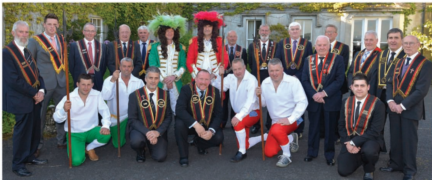
Members of RBP 1000 and some of the re-enactors at the launch of this year's Sham Fight. Rowland White