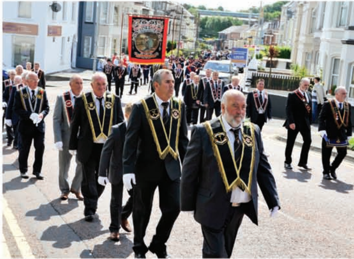
Sir Knights from Lurgan District on their annual parade in Bangor.