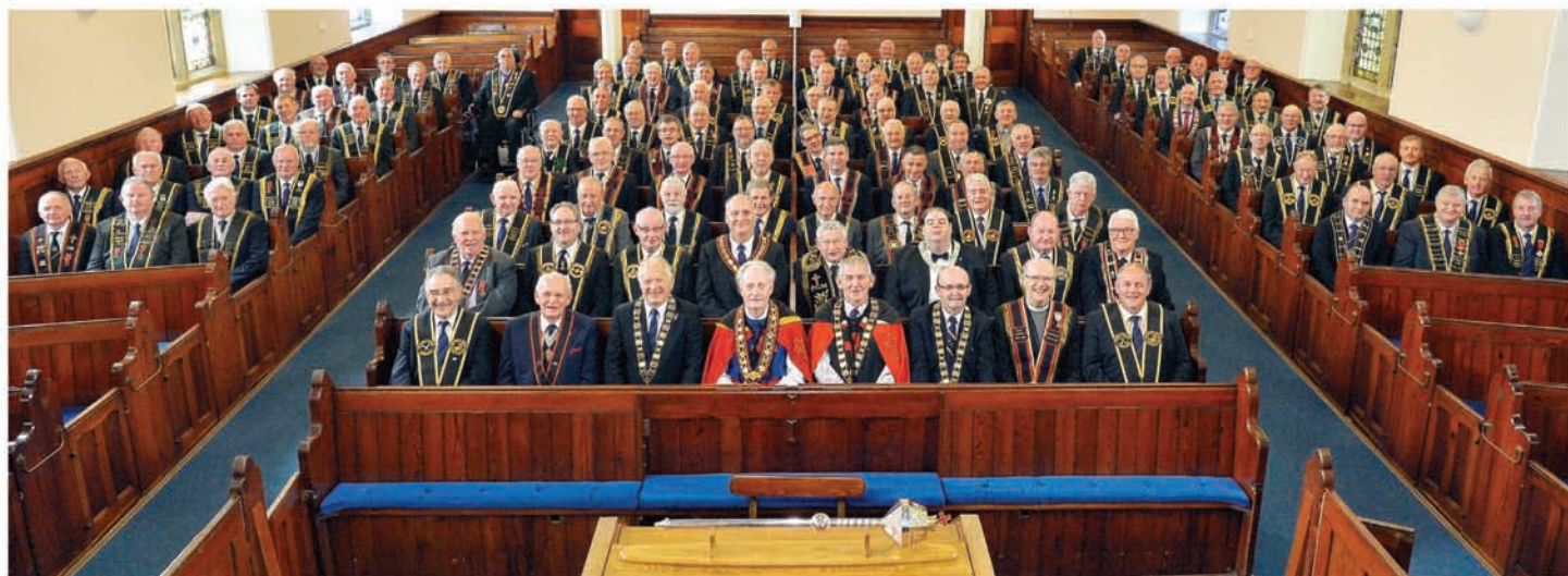
Sir Knights from around the world attended the Imperial Grand Council in Cullybackey in June. The meeting was held in Cunningham Memorial Presbyterian Church Hall.