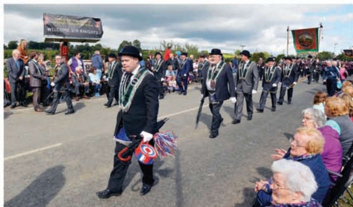
RBP 882.