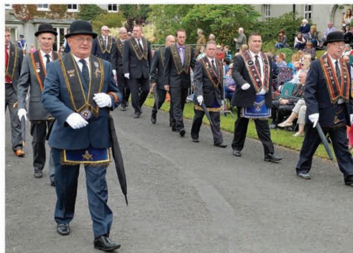
Visiting marchers.