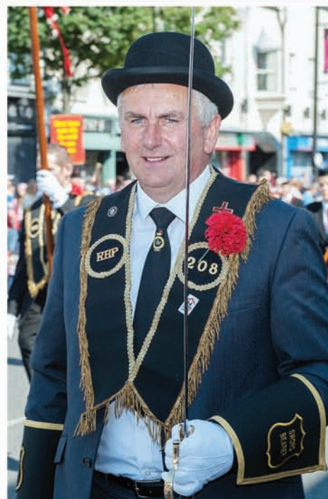
A Sword Bearer from RBP 208