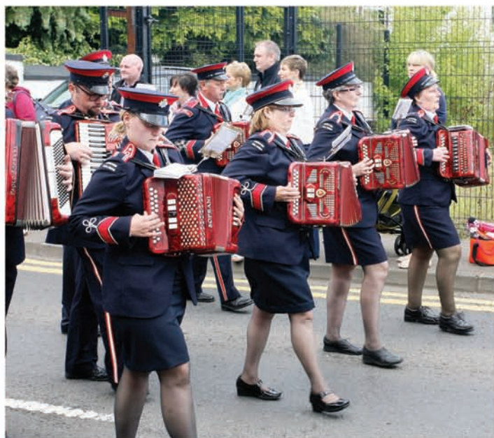
Fenagh accordion band pictured the Royal Black parade. GB3656D