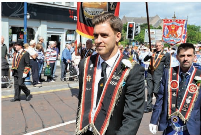
Members of RBP 108 on parade in Bangor.