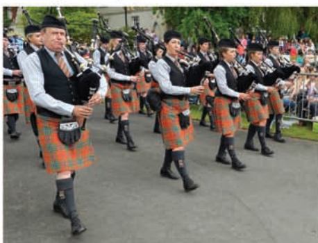
Whitewater Pipe Band from Newtownhamilton.