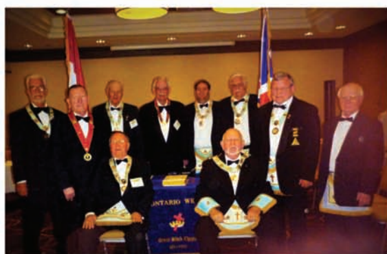
Officers of Ontario West with Grand Secretary of the Grand Orange Lodge of Canada and a Past Provincial Grand Master of the Provincial Grand Black Chapter of Ontario West.