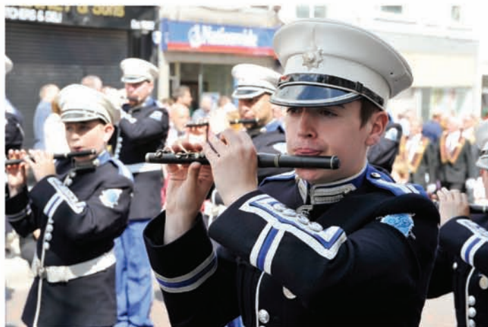
There was plenty of good music for the spectators to enjoy at the July 14th Parade in Bangor.