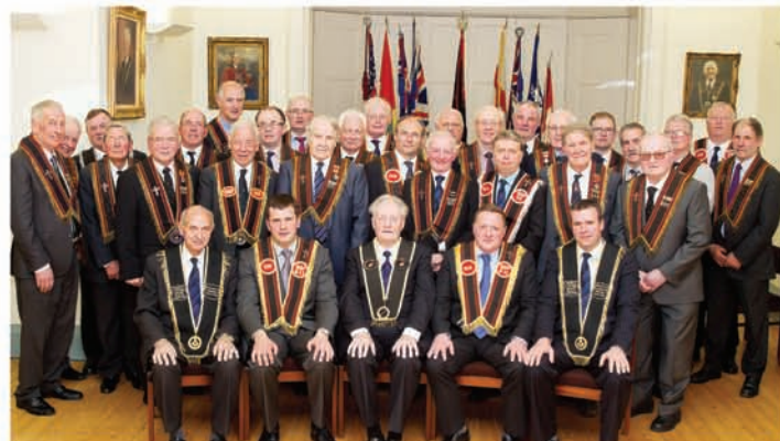
Members pictured at a meeting of Killyman Temperance RBP 511 at Brownlow House to mark its 125th anniversary.