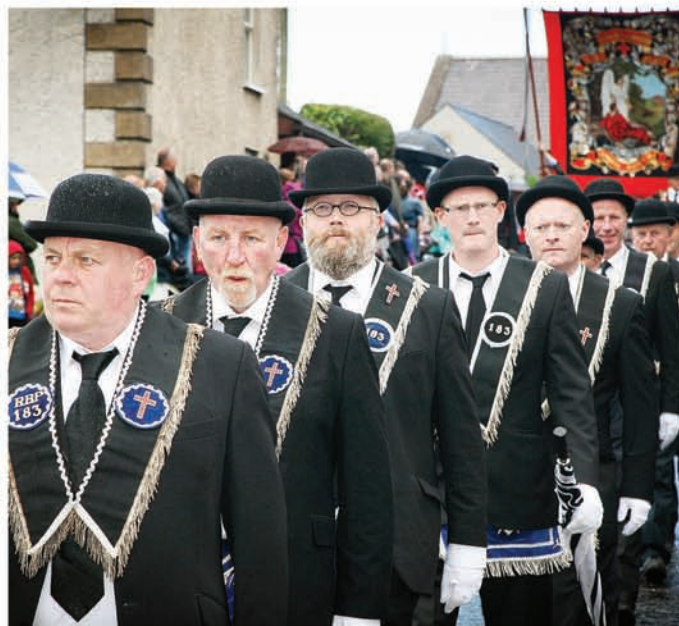
Sir Knights of Lisnaskea True Blues.

"Each one present here today has a duty and a moral responsibility to set an example for others to follow, so many more people can experience that peace through a life lived in accordance with God's wishes."