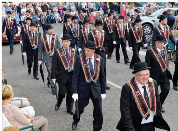
RBP 393