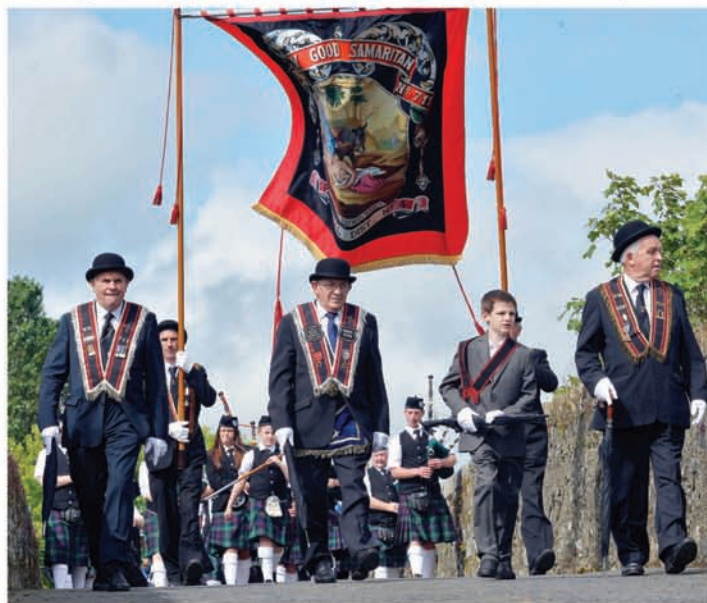
RBP 711.