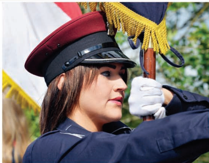
Standard Bearer for Killylea Young Defenders.