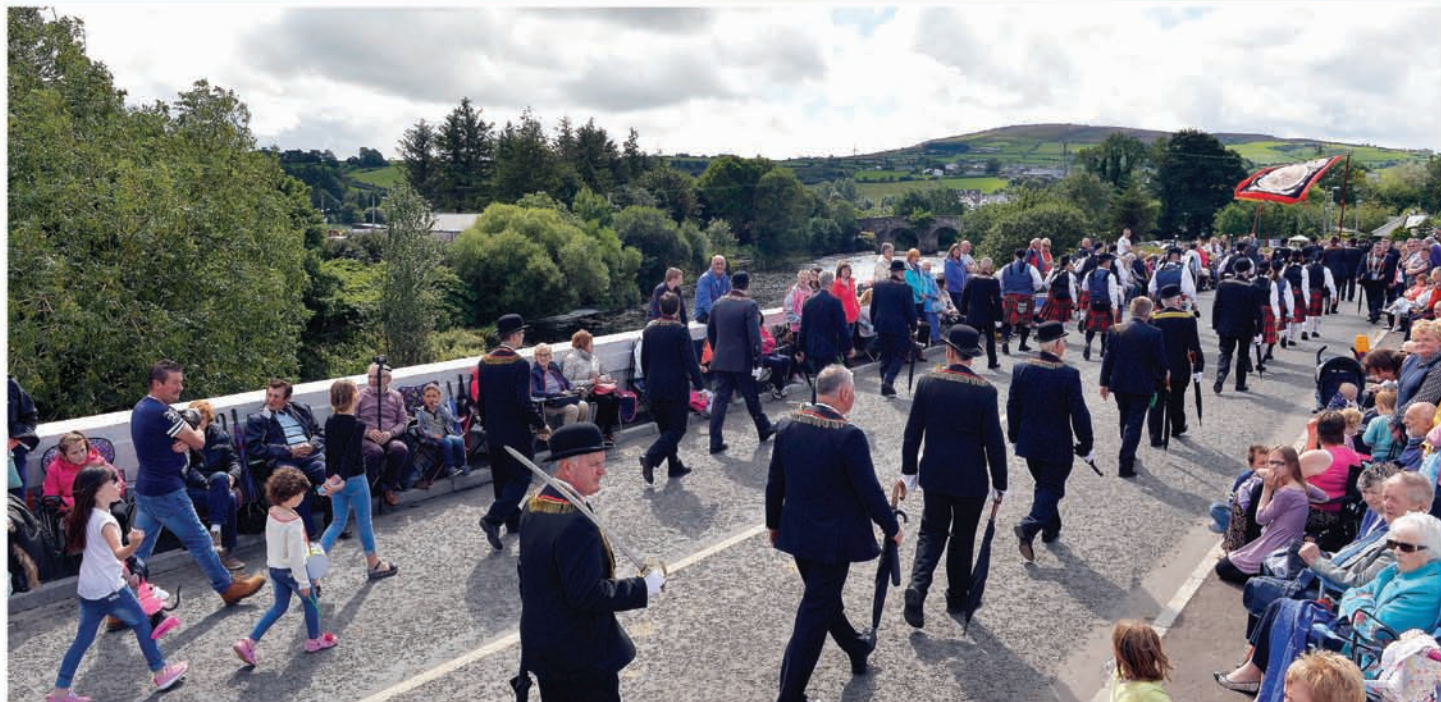
Through the Co Tyrone countryside.