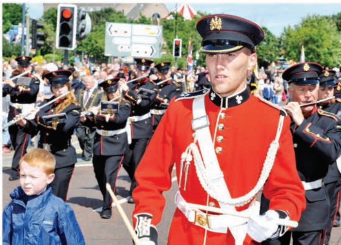
A splash of colour from the bands which took part in the Bangor parade.