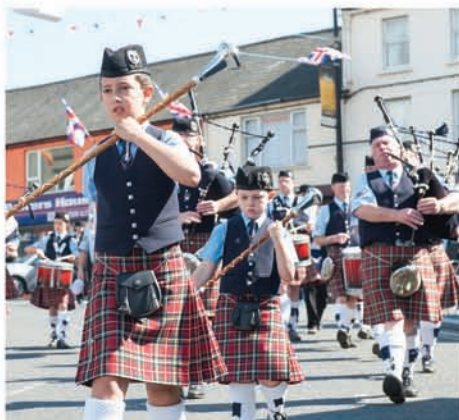
The Skirl of the pipes was also on show.