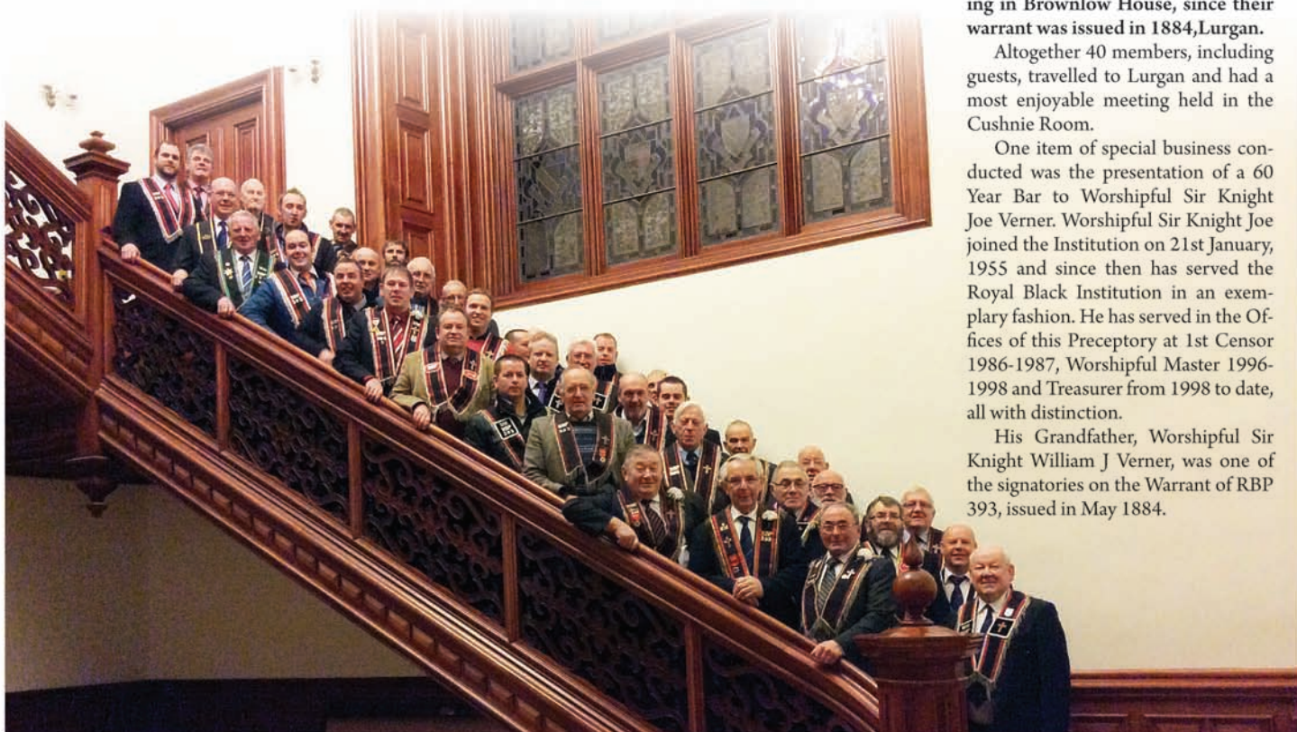
Members and guests of RBP 393, Encamped at the Birches, at their first monthly meeting at Brownlow House.

R BP 393, Encamped at the Birches, created a first in the preceptory's history when they held their first monthly meeting in Brownlow House, since their warrant was issued in 1884, Lurgan.