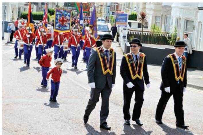
Lurgan District No. 2 on their annual parade in Bangor on July 14.