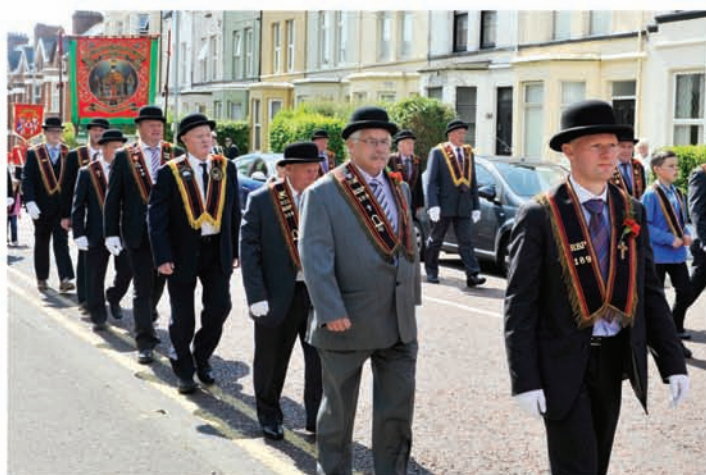
Striding out – members of RBP 189 – on parade in Bangor.