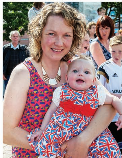
Enjoying the parade in Kilkeel.