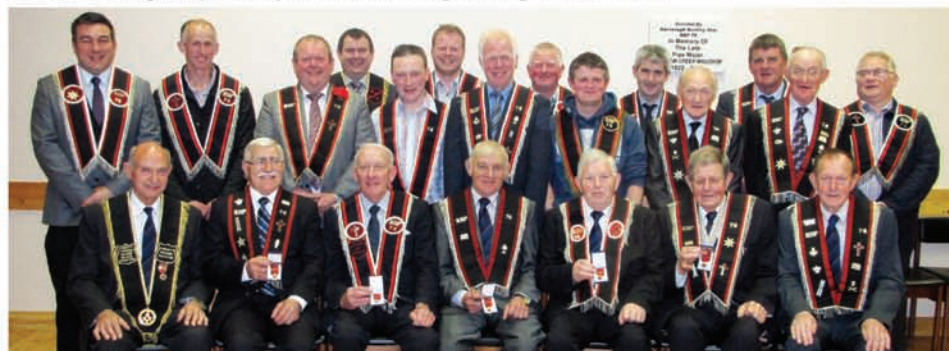
Garvetagh Guiding Star No 76 officers, members and guests who attended a presentation of 50 year service Jewels in Garvetagh Orange Hall, Castlederg.