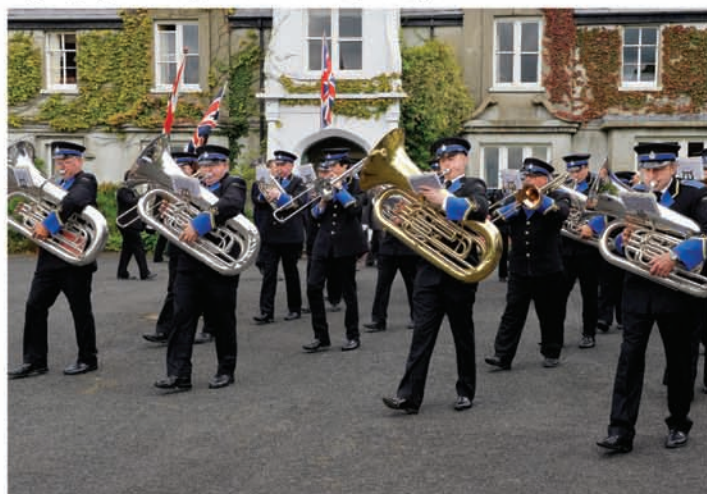
Roughen Silver Band.