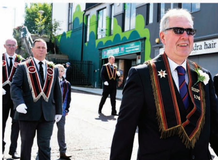
Members of RBP 176 – one of the 12 preceptories on parade in Bangor.