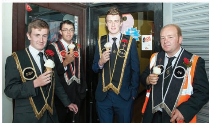
Enjoying a well earned Ice Cream at the Kilkeel parade.