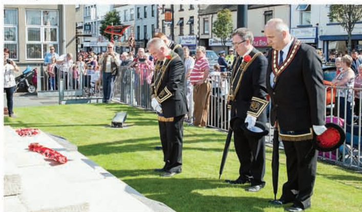
District Officers paying their respects at the cenotaph.