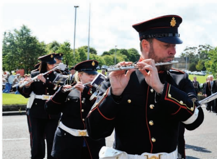
Setting the right note for the Lurgan District parade in Bangor on July 14.