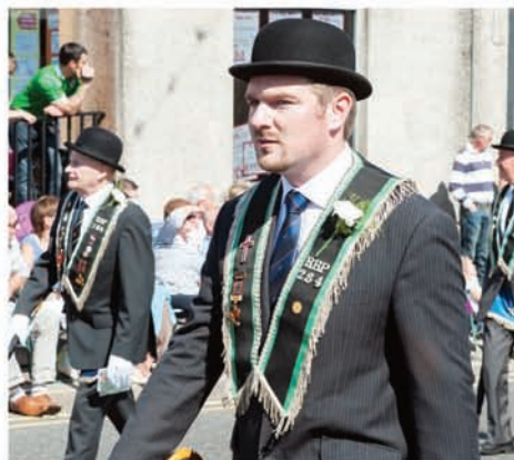
Members of RBP 284 on parade