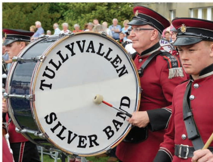
Ex-Stormont DRD Minister Danny Kennedy MLA beating the base drum for Tullyvalen Silver Band.