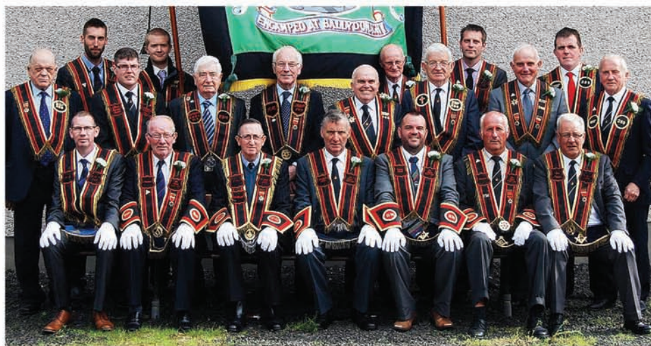
Members of The Mount RBP 289, Antrim, enjoying their 50th anniversary.