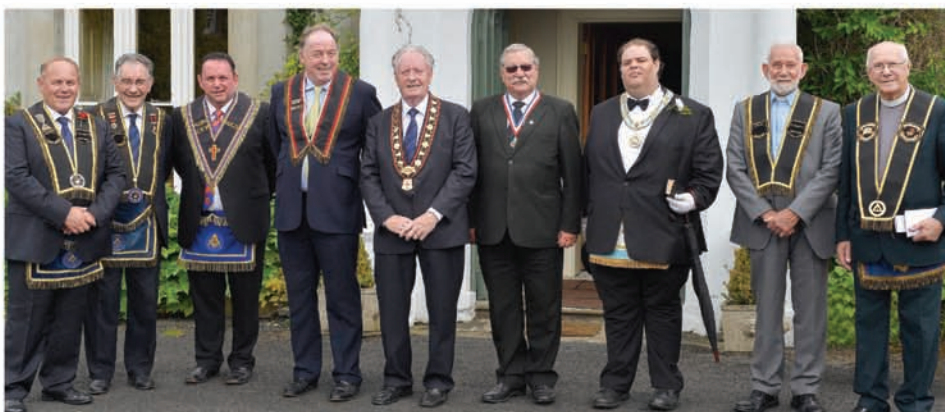
VIP Reception Party at Scarva House.