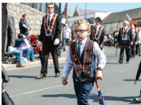
Young and old stepped out in Kikeel!