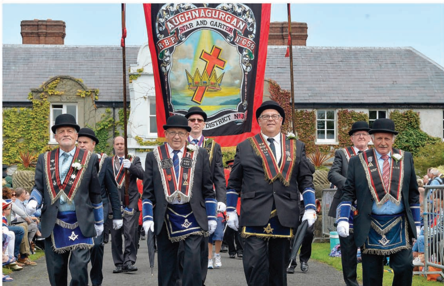
Aughnagurgan RBP 658.