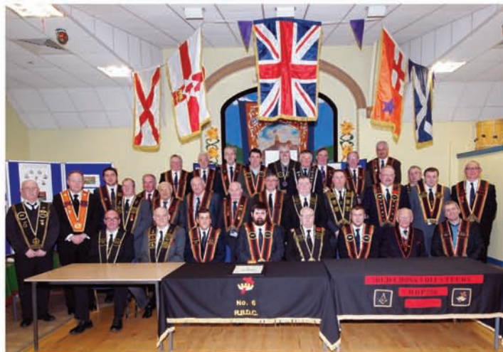
Glenavy RBP 286's Red Cross Night in West Belfast Orange Hall in March this year.