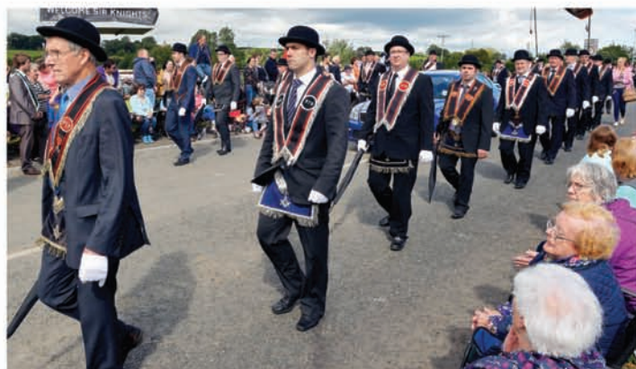
RBP 979. Rowland White/Presseye