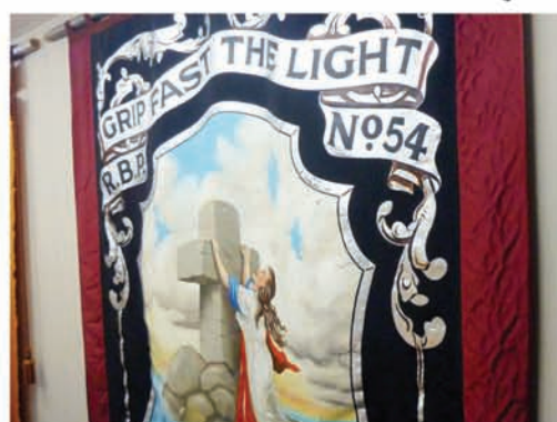
RBP 54 old banner on display in the Museum of Orange Heritage at Sloan's House.

At the conclusion of the evening, Sir Knight Watson presented RBP 54 with a special commemorative certificate to mark the occasion and all retired for supper to the Sloan's Coffee Shop.