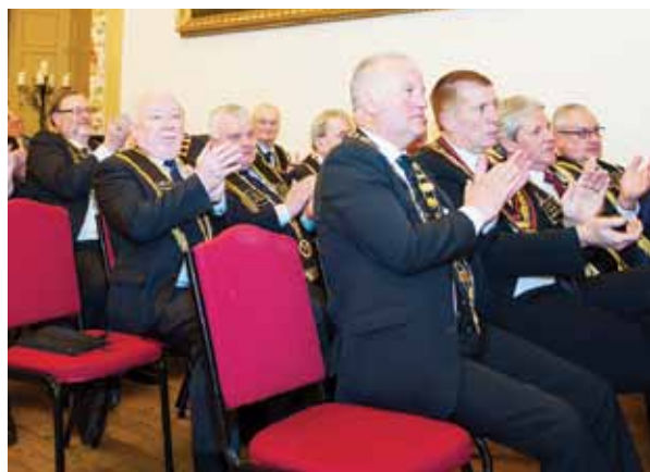
Sir Knights in attendance at the Macmillan cheque presentation at Brownlow House