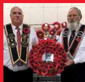
Remembering the Somme Sacrifice - Pages 10 & 11