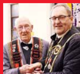
Notes from England & Scotland - pages 28 & 29