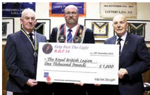
Representatives from RBP 54 presenting a cheque for £1,000 to the Royal British Legion at the December meeting.