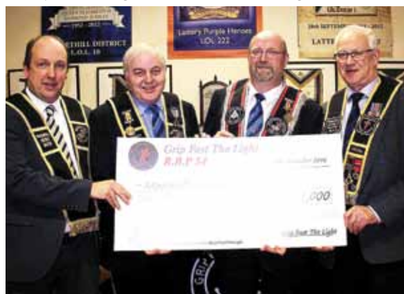
Representatives from RBP 54 present funds in support of the Grand Master's Appeal for Macmillan Cancer Support to Co Armagh District Officers.