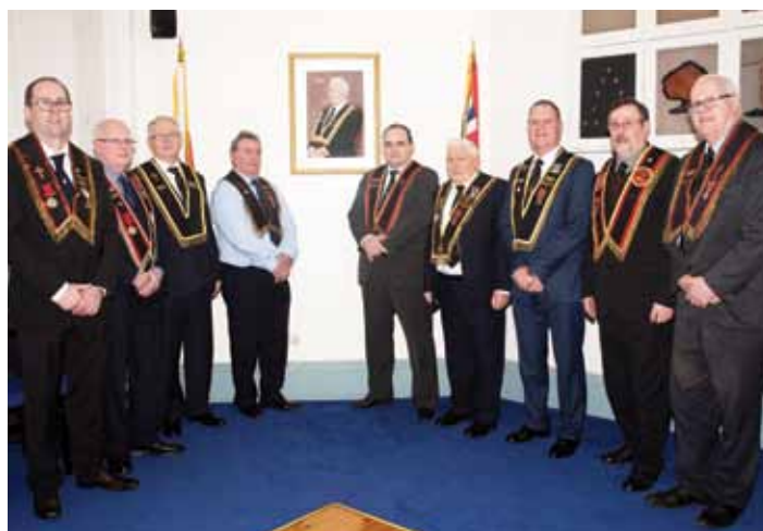
Sir Knights from Sons of Joseph RBP 207 at the dedication service

Afterwards a light supper was provided for all in attendance.