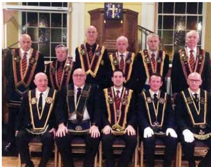
Six Sir Knights from Samuel Frickleton VC Memorial RBP 1917 recently received their Red Cross Degrees. The preceptory held the special meeting in Slamannan Parish Church following refurbishment.