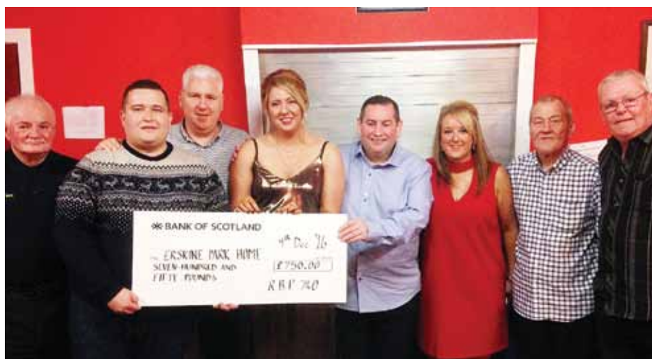
Members of RBP 740 Rev. James M. Moutray Memorial - encamped at Kirkintilloch, Scotland - recently donated £750 to Erskine Park Home. The specialist dementia unit is part of the Erskine ex-servicemen and ex-servicewomen's hospital. The money was raised last year during RBP 740's annual sponsored walk from Kirkintilloch to their District Chapter encampment in Maryhill, Glasgow.