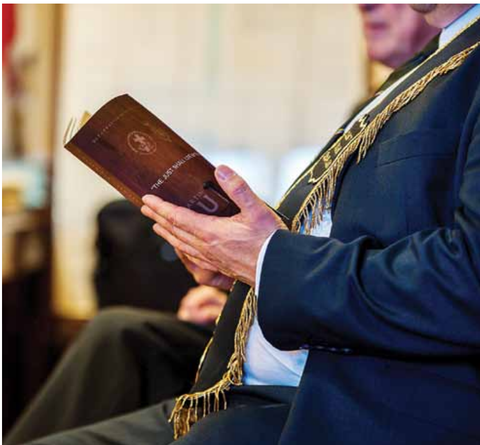
The Luther 500 resource pack made available by the Royal Black and Orange Institutions.

"As our Grand Masters regularly remind us, both Institutions are Bible-based and Christ-centred and these resources serve as a great purpose in helping us to both live the faith we profess and give an answer for the faith that is in us."