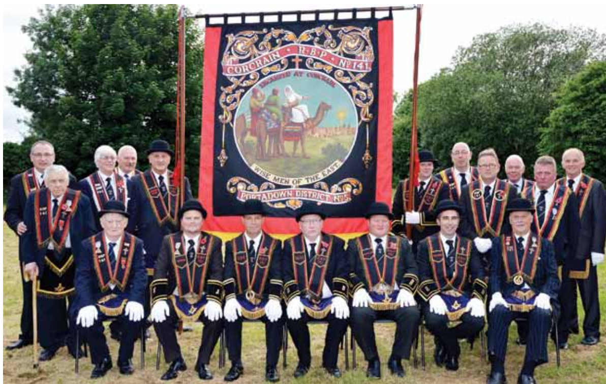
Sir Knights from Corcrair RBP 141 pictured with at the dedication of their new banner.

The next Prayer Breakfast has been arranged for the morning of Saturday 4 November 2017. Further details later. Please keep the date free.