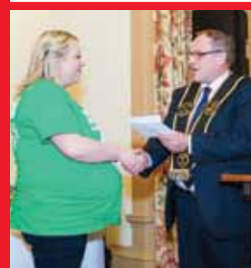
MacMillan Charity Cheque Presentation - page 9