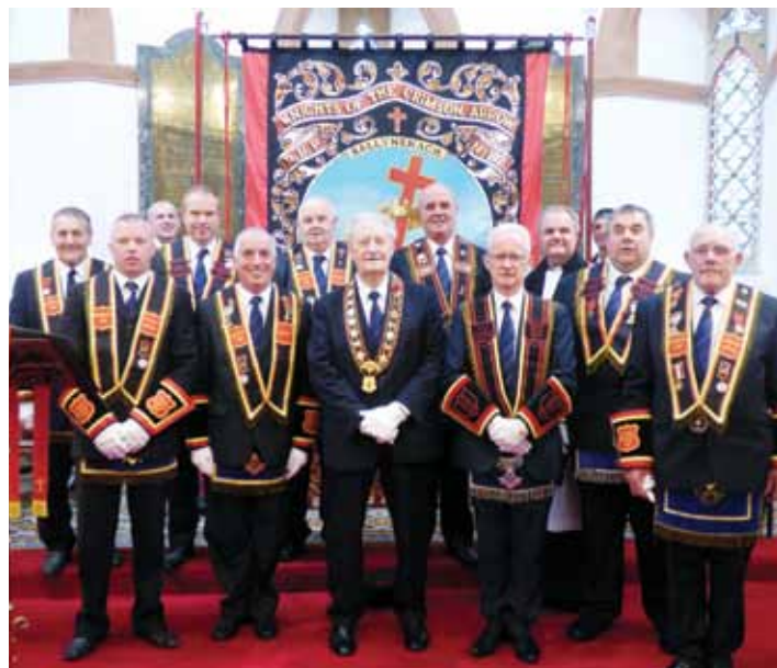
The unfurling and dedication of a new banner for Ballynenagh Knights of the Crimson Arrow RBP No. 1112, South Londonderry Royal Black District Chapter No. 4.