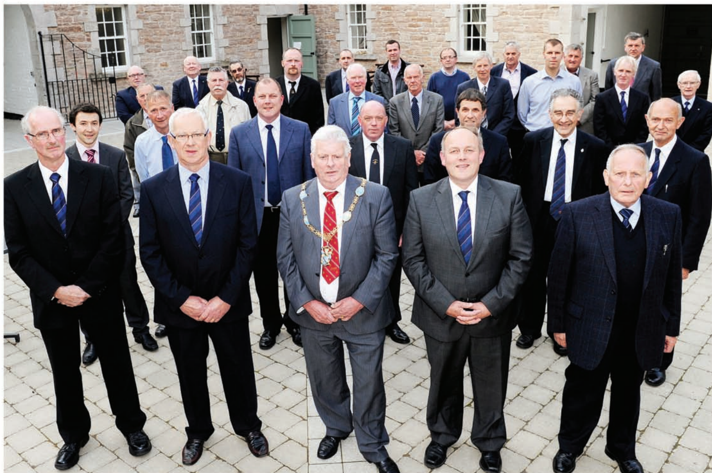
Sir Knights who attended the civic reception for districts attending the Last Saturday Parade in Armagh. In the picture are Sir Knights from Aughnacloy, East Tyrone, Killyman, Summerisland and Primatial with the Lord Mayor Sir Knight Robert Turner.