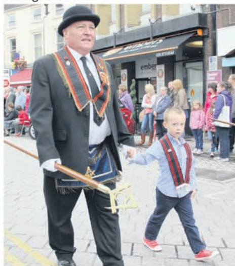
A proud day for grandad and grandson as they pace themselves through Armagh. dd3670