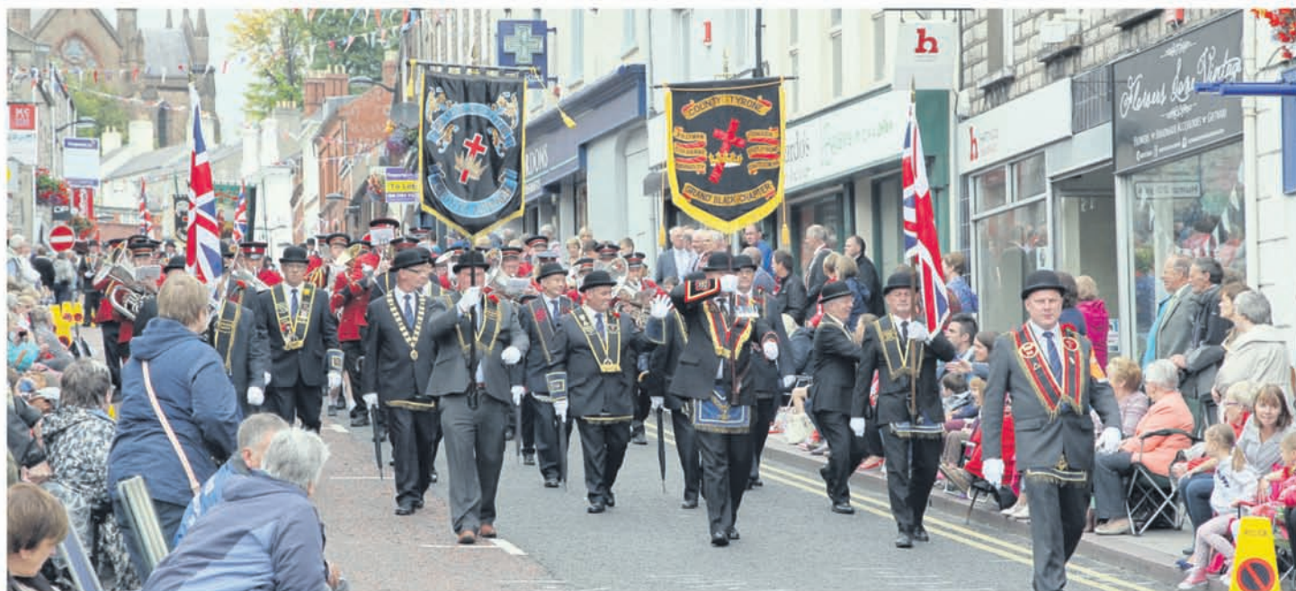
Sir Knights Grand Black Chapter Armagh & Tyrone parade through Armagh.dd3639