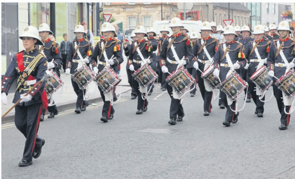
The eyecatching Protestant Boys Omagh Melody Flute Band.dd3673