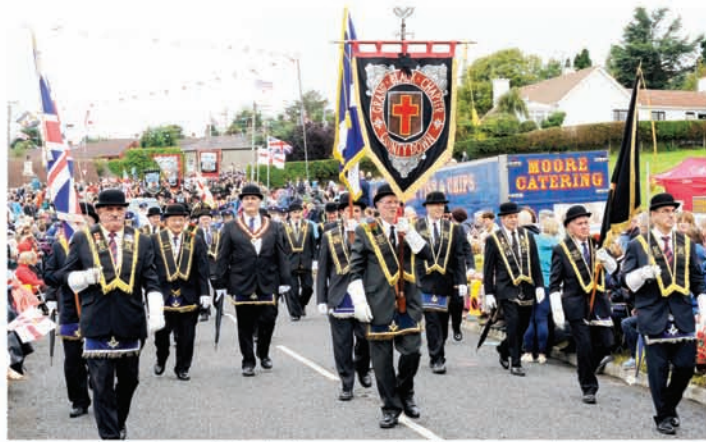
County Down Grand Black Chapter office bearers and colour party pictured arriving at the demonstration field at the County Down Grand Black Chapter Demonstration at Rathfriland on Saturday 30th August.