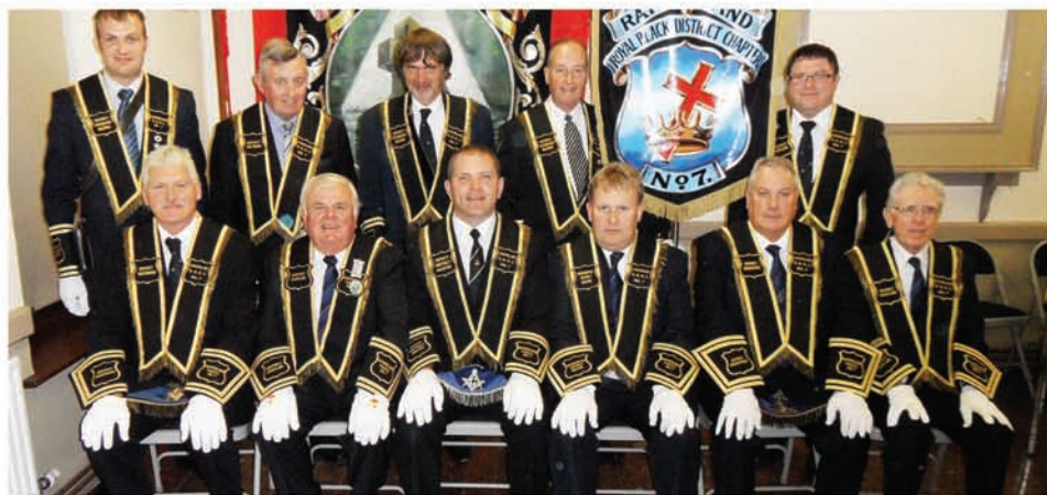
Rathfriland Royal Black District no 7 officers pictured after receiving new district cuffs.