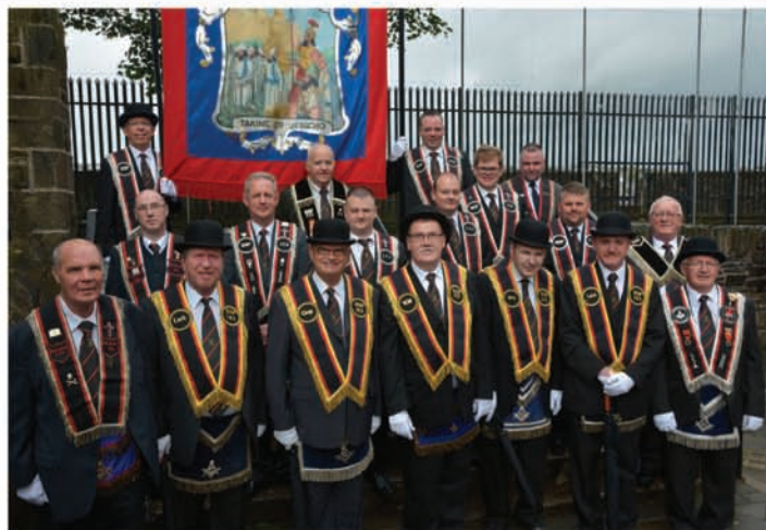
These members of R.B.P. 113 were pictured on Saturday. INLS3514-117KM