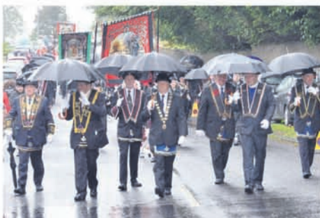
The parade on route on Longland Road during the Royal Black Institution 'Last Saturday' parade in Donemana. AN3641