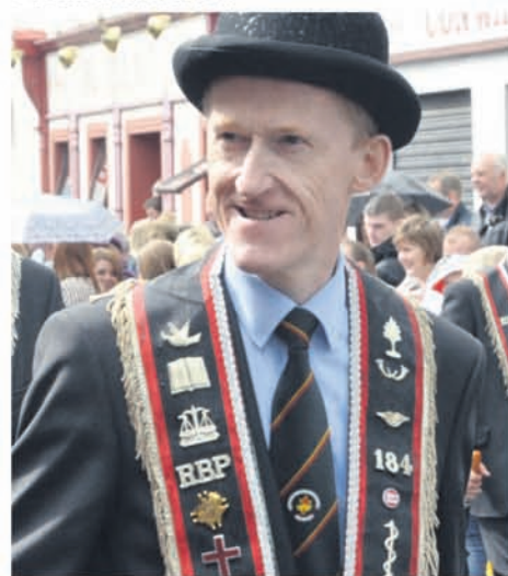
A Member of Sir Knight William Fyffe Memorial RBP 184, Strabane, on parade in Donemana on Saturday. AN3668