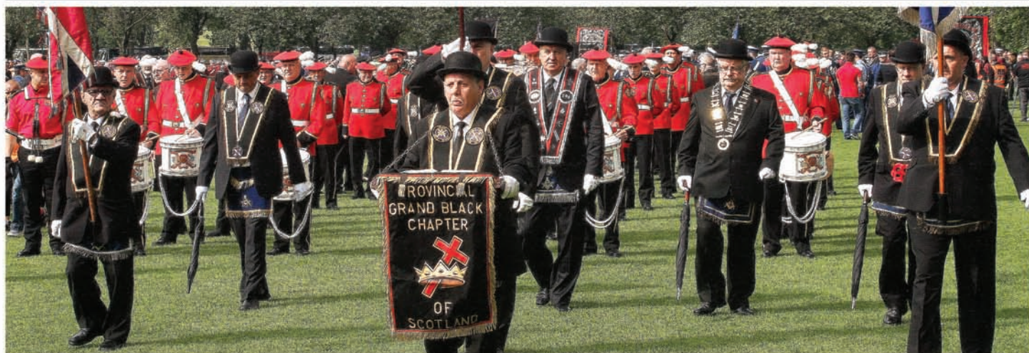
Enjoying the PGBC of Scotland's Relief of Derry demonstration which was held in Edinburgh on Saturday 9th August, 2014.

To date R.B.P 160 has raised through the offerings the sum of £4,139.00. The offering collected in each has been donated back to the Church Session of the Minister who conducted the service on the night. The Sir Knights of Morning Star R.B.P 160 are extremely proud of their Christian outreach in the town of Coatbridge over the last 150 years.