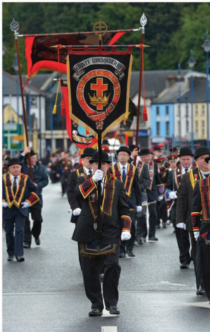
The banner of the County Londonderry Grand Black Chapter pictured at the head of Saturday's parade. INLS3514-119KM