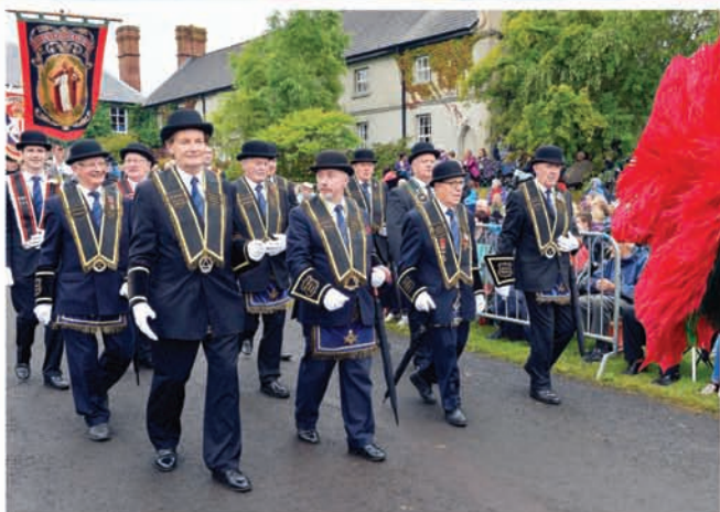
Portadown District Officers

The money went to organisations including the Chest, Heart and Stroke Association, Action MS, Open Doors Ministry in Sudan, Diabetes Research, Kiwoko Hospital, Uganda and the Alzheimer's Society.