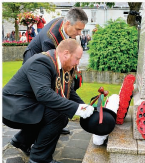
Members of RBP 1000 laying a wreath at the war memorial