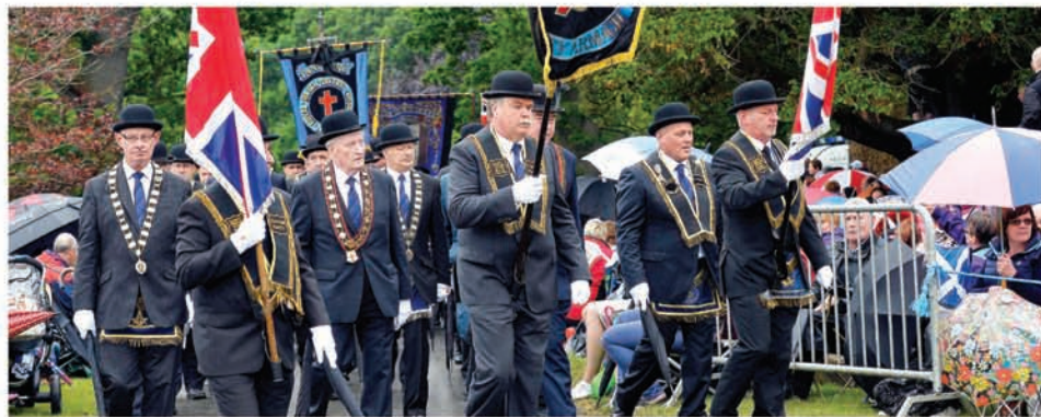
The head of the parade