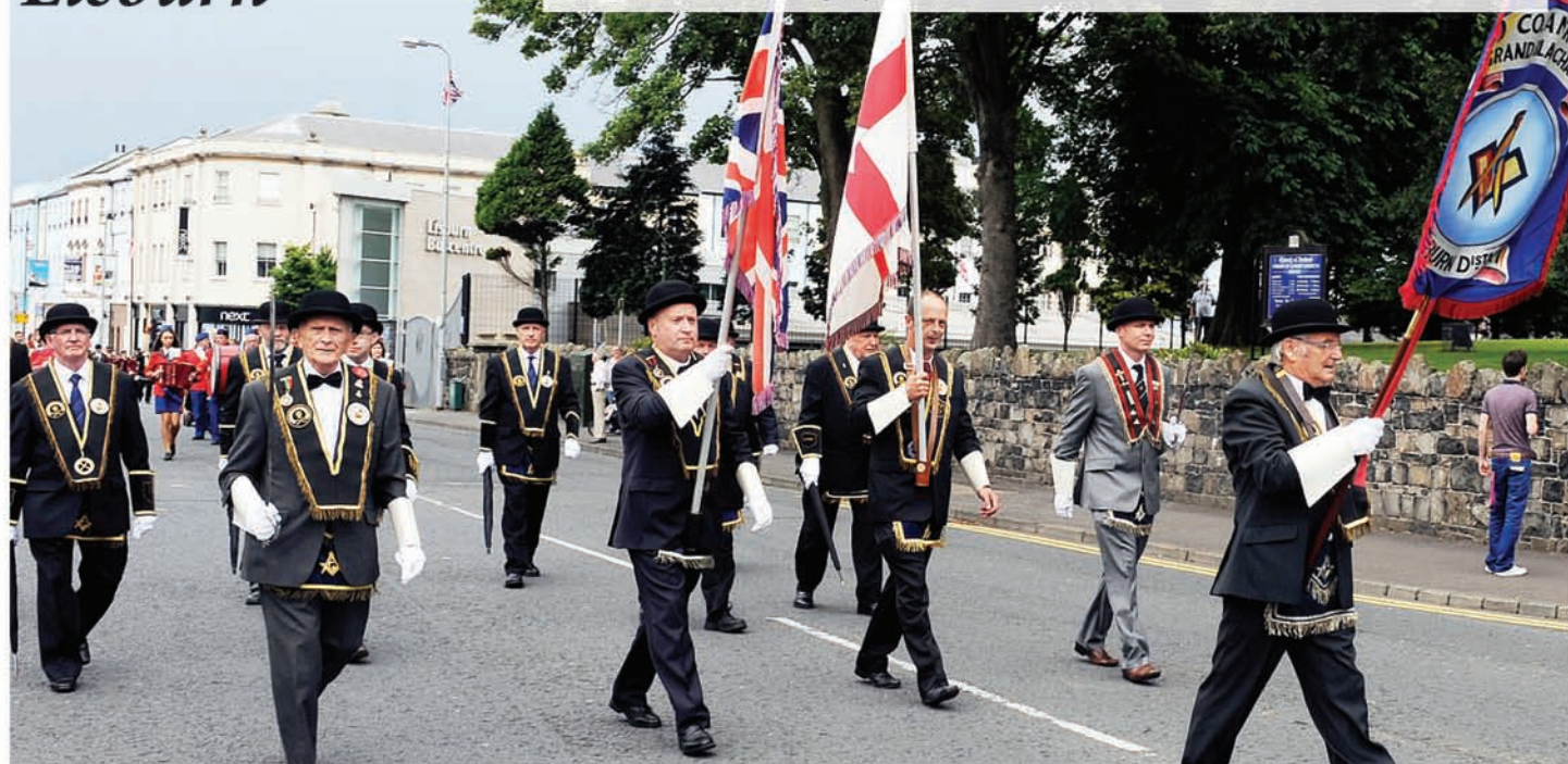
Lisburn Royal Black District Chapter No 1 colour party and district office bearers pictured as the parade arrives at Christ Church Parish for the annual 'Relief of Derry Service'.