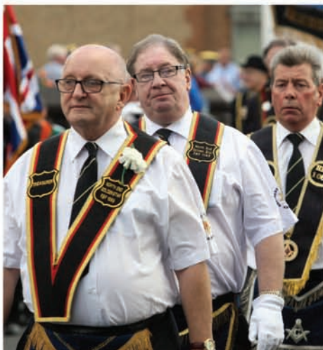
Sir Knights of RBP 1069.