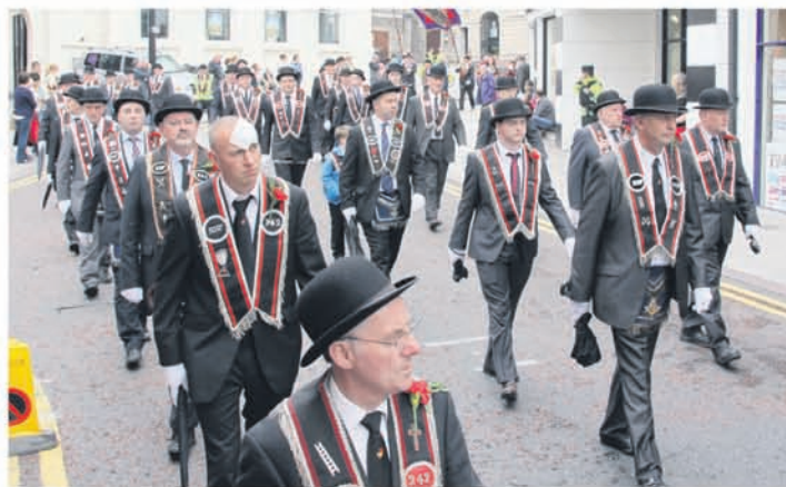
A strong contingent of Sir Knights RBP 242 wend their way through Armagh.dd3666