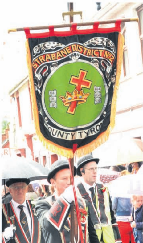
The Strabane District No 2 bannerette leads the Strabane preceptories and bands through the village during the 'Last Saturday' parade in Donemana. The Strabane district is celebrating its 150th anniversary this year. AN3664