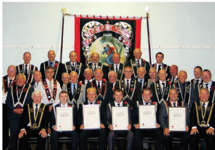
Sir Knights from Annalong RBP 34 and Ballinran RBP 431 with those who received their Red Cross Certificates.