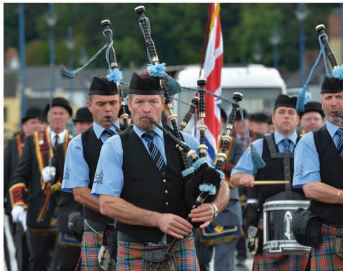
The Ringsend Pipe Band pictured taking part in Saturday's Royal Black Preceptory parade in Londonderry. INLS3514-126KM