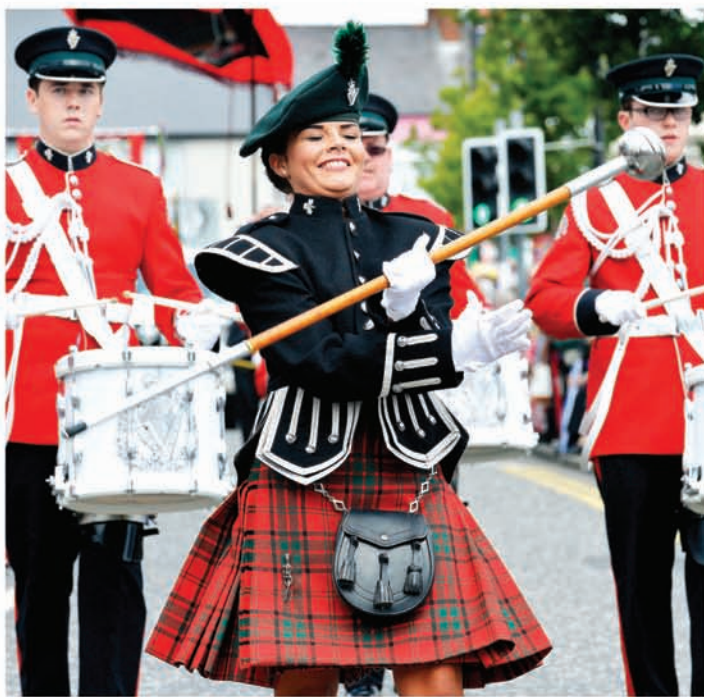
Stepping out with Lisburn Young Defenders