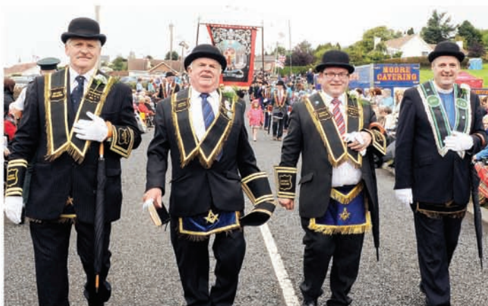
Some Sir Knights of host district, Rathfriland Royal Black District Chapter No 7, pictured arriving at the demonstration field at the County Down Grand Black Chapter Demonstration at Rathfriland on Saturday 30th August.