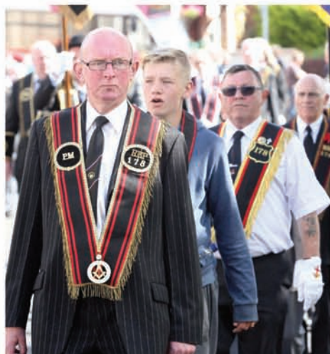
Sir Knights of RBP 178