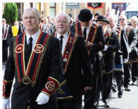
Co Antrim, Sir Knights of RBP 229.