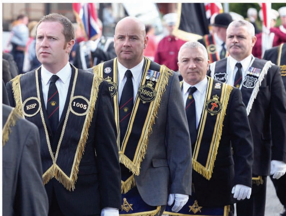
Sir Knights of RBP 1005.