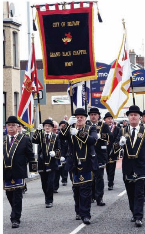
City of Belfast Grand Black Chapter in Larne.