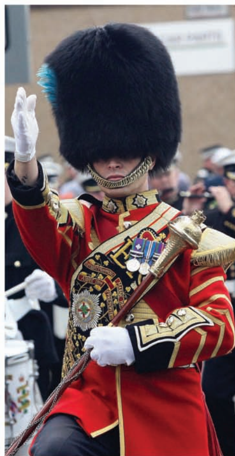
Keeping the step correct in Larne.