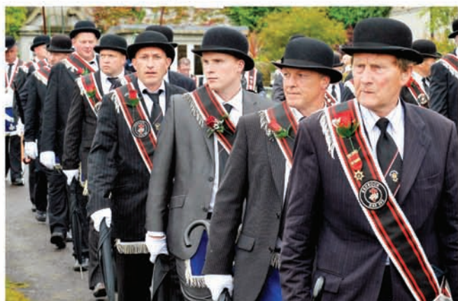
RBP Redrock 595