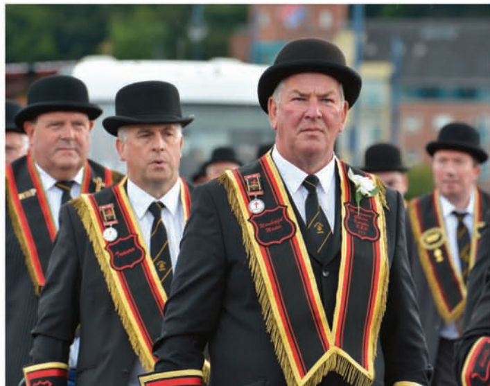
Members of the Royal Black Preceptory pictured on parade in Londonderry on Saturday. INLS3514-125KM