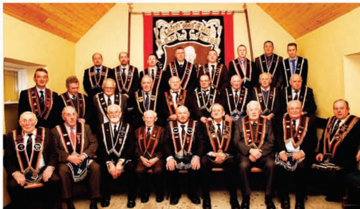
Sir Knights of Lackey Sons of Levi, RBP 785, Co. Monaghan, who attended a special evening to present long service jewels and bars.