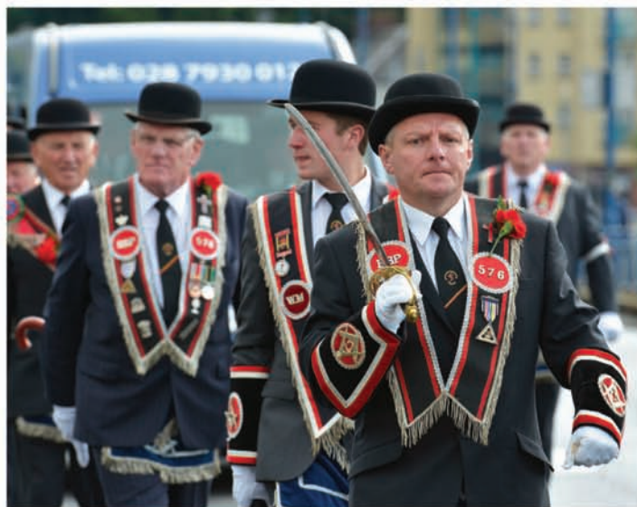
A sword bearer with R.B.P. 576 pictured during Saturday's parade. INLS3514-123KM