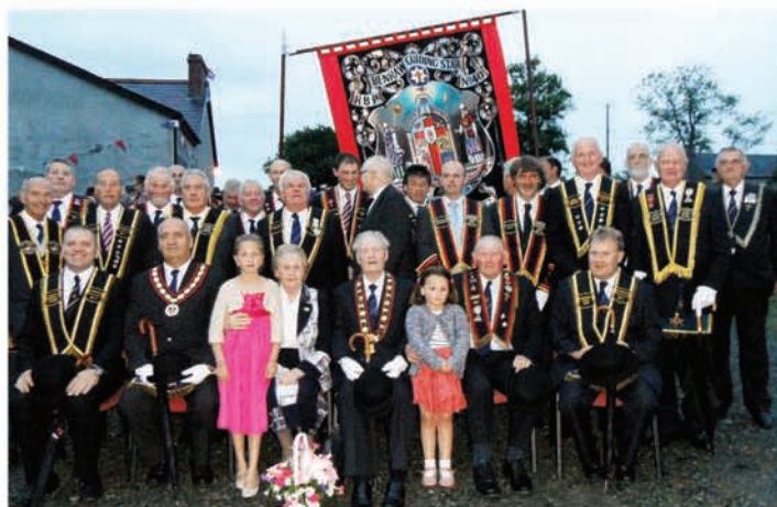
Members of Benraw RBP 40 along with the platform party at the unfurling ceremony at Benraw Orange Hall.

The platform proceedings were brought to a close with the singing of the of the National Anthem lead by Legananny accordion band before Benraw Pipe Band headed the parade of the new banner along with Crimson Arrow Pipe Band, Newcastle and Star of Maghera Flute Band.