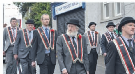
Members of Lisleen RBP 191, Castlederg, on parade during the 'Last Saturday' parade in Donemana. AN3678