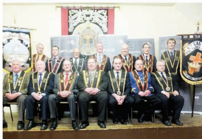
Members of the County Cavan and County Monaghan Grand Black Chapters who took part in the Take 5 project.