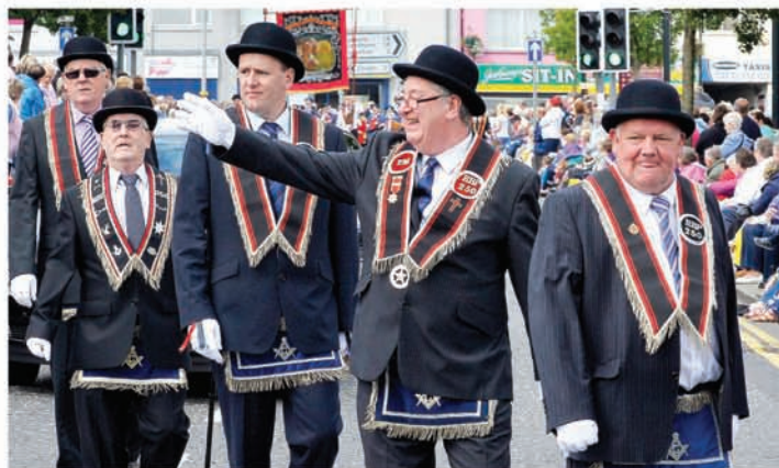
Nice to see you!