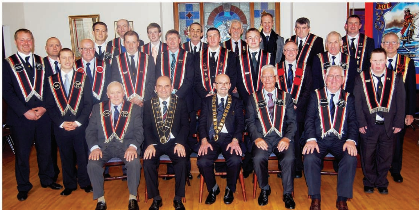
Officers and Sir Knights of Ballantine Heroes Royal Black Preceptory after their Installation of Officers held in Killaloo Orange Hall on 8th May.