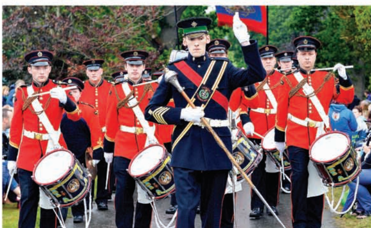
Churchill Band, Londonderry