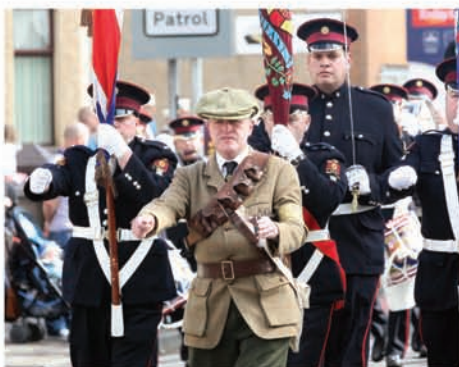
Ulster Volunteer Flute colour party.