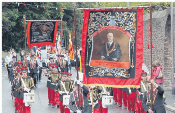
'Sir William Allen Memorial' RBP 153.dd3683