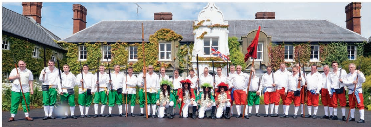
The joint armies