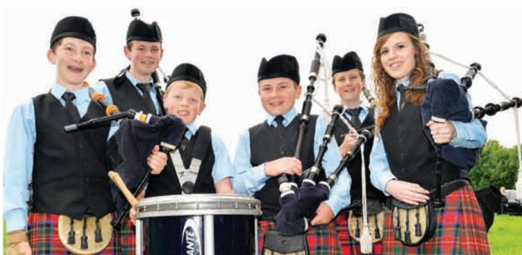
A group of young musicians from Crozier Memorial Pipe Band