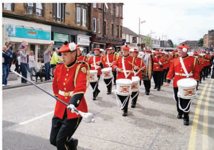
2013 Relief of Derry Demonstration - Netherton Road Flute Band on the march