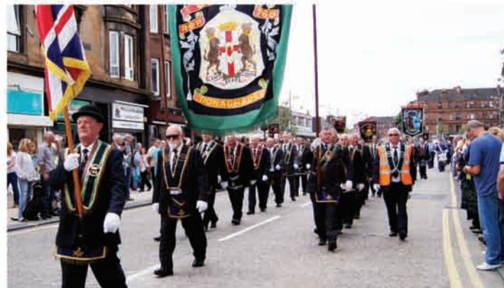
2013 Relief of Derry Demonstration - Visiting Preceptory Ulster RBP 768 (Donaghdee)