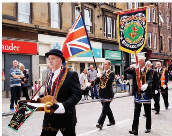
2013 Relief of Derry Demonstration - Airdrie & Coatbridge R.B.D.C No.3