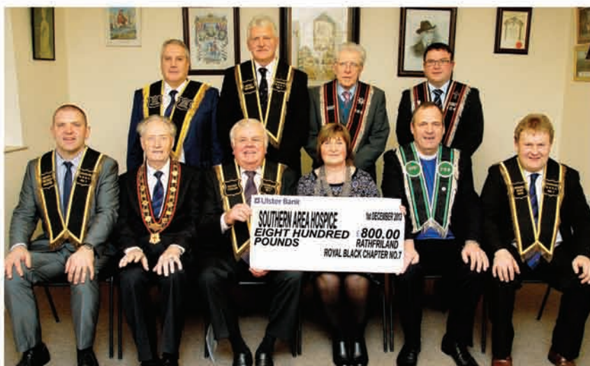
Sir Knights of Rathfriland Royal Black Chapter No.7 presenting a cheque to the Southern Area Hospice. The proceeds were raised at a Carol Service held in Ballyronney Orange Hall.