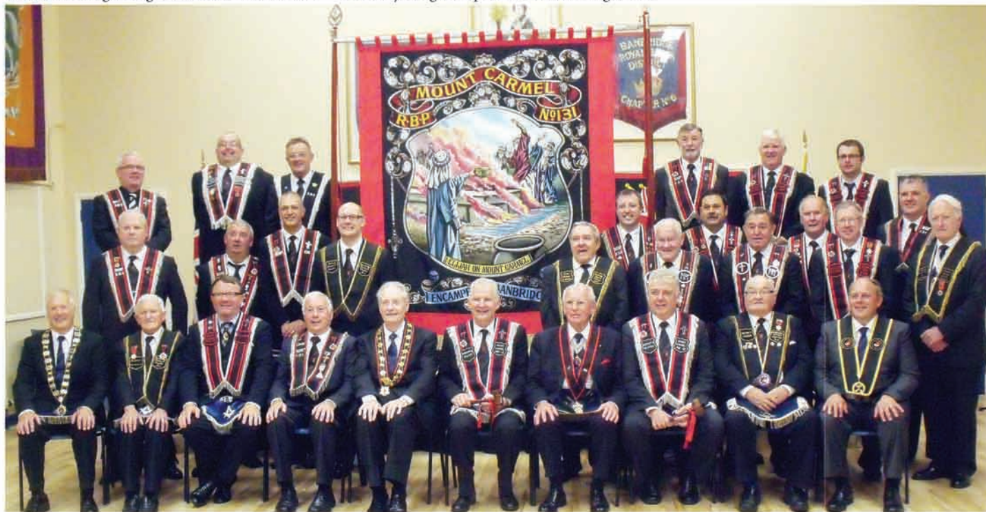
The Sir Knights of Mount Carmel RBP 131, Banbridge, with their beautiful new banner.

The Sir Knights of Mount Carmel RBP 131 also proudly carried their new banner at the Black Saturday demonstration in Banbridge in 2013.