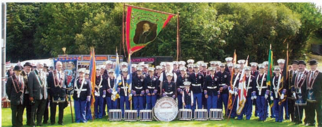
Sir TD Rice Memorial Royal Black Perceptory 689 and Downpatrick Defenders Flute Band marking the 30th anniversary of the association between the two organisations at the Last Saturday.

has also fulfilled other duties, including the Preceptory's Annual Divine Service in Carryduff Presbyterian Church and Saintfield District Service.