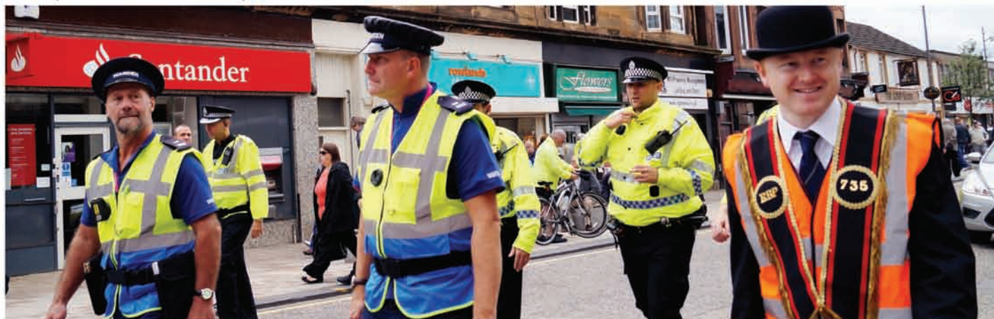
2013 Relief of Derry Demonstration - the last Sir Knight on parade in Renfrew!