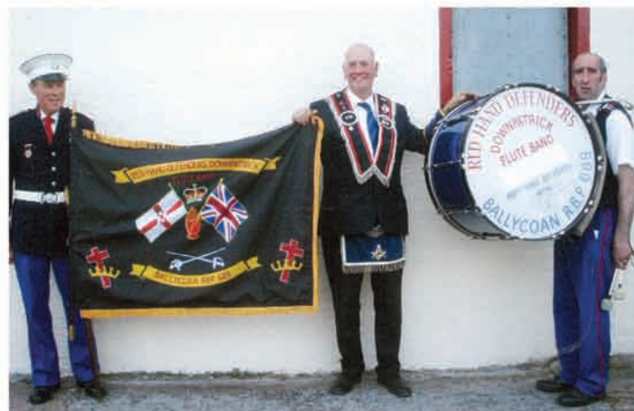
The Standard and Bass Drum marking the 30 year association between Sir TD Rice Memorial and Downpatrick Defenders Flute Band.