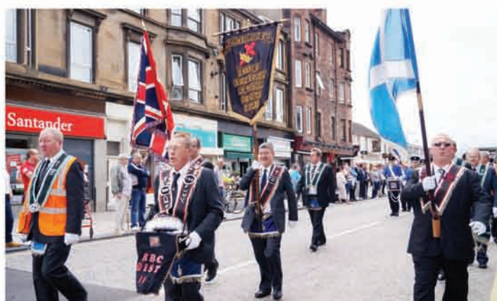
2013 Relief of Derry Demonstration - James Martin Memorial R.B.D.C No.11