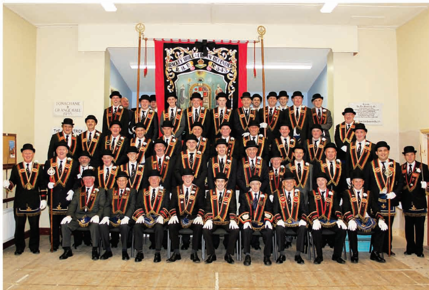
The members of Brackley RBP343, East Tyrone district, taken before parading the village of Beragh on the Last Saturday morning, prior to heading to Dungannon.