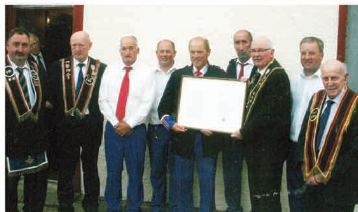
The presentation of a framed copy of minutes from 30 years ago regarding the engagement of Sir TD Rice Memorial and Downpatrick Defenders Flute Band.