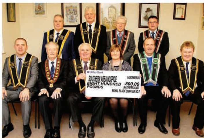
Sir Knights of Rathfriland Royal Black Chapter No.7 present a cheque to the Southern Area Hospice. The proceeds were raised at a Carol Service held in Ballyroney Orange Hall.