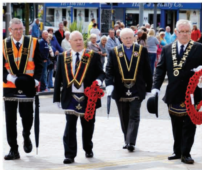
2013 Relief of Derry Demonstration - P.G.B.C Officers approaching the War Memorial Renfrew