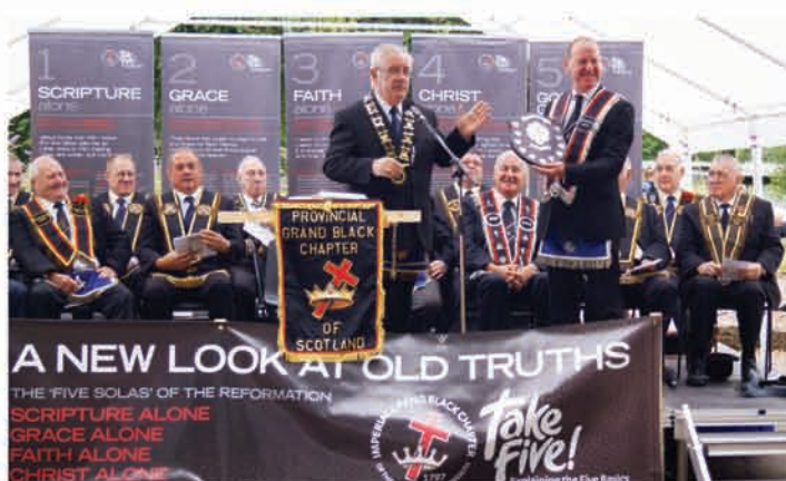
2013 Relief of Derry Demonstration - Shield Presentation to Worshipful Master of RBP 296 Hope of Airdrie