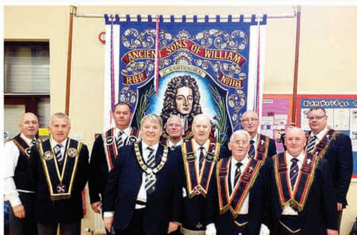
Members of the Ancient Sons of William RBP 118 from Banbridge pictured with their new banner which was on parade at the Last Saturday.