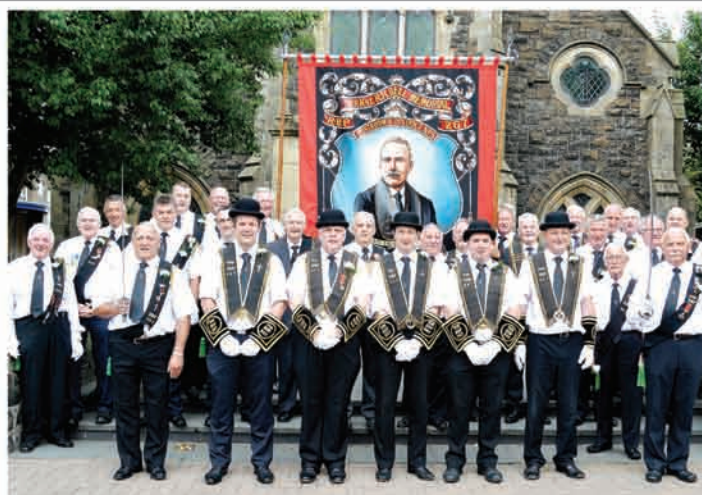
Members of Portadown RBP 267 pictured before a recent parade.

McMordie Memorial Temp, Clifton Street No 5 District, issued on 3 November, 1914